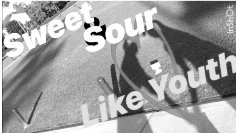
Figure 3. Scene from a Mock Advertisement on Gummy Candy

Out of the 16 mock commercials, 10 were information-based, three were comparative, and three were story plus information-based. The comparative mock advertisements were all developed by second-year students. The participants had to aim for the American audience, and they had learned at the beginning, that American advertisements tended to be more explicit and direct than Japanese advertisements. However, in order to see if they actually had the American audience in mind, the author checked the television commercials of the same products in Japan which were airing around the same time when the task took place. Out of the 10 products, commercials for six products were story-based. In other words, the information was only given indirectly in stories which almost sounded irrelevant to the product. For example, the 30 second commercial on green tea had three people talking about life in front of a Japanese traditional house, and the product itself did not appear in the advertisement until one of them started drinking green tea toward the end. Commercials on three products were music or rhythm-based, that is, they simply repeated the product name many times without further information. There was one information-based commercial, but it was only online, and not aired on television. These dramatic differences show that the participants intentionally chose different advertisement types for the American audience.