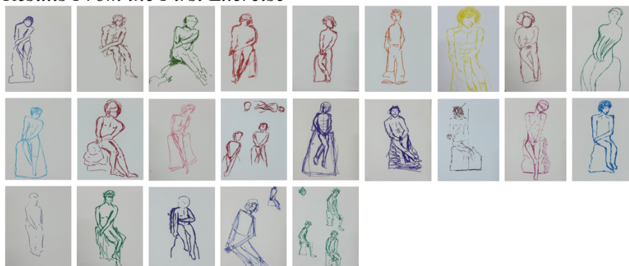
Results From the First Exercise

The students proposed the hypothesis that the hands of the sculpture might constitute the most significant symbolic element of the work, representing the delicate boundary between scientific knowledge and the beliefs that shape the symbolic universe of O Desterrado . These elements exist for concrete reasons, whether due to physical necessity or to discursive and/or thematic considerations related to the work itself. Indeed, by using his own hands as a mold for creating the sculpture, Soares dos Reis opened a space for the formation of beliefs and a collective imagination that transcend the technical aspects to be evaluated during the formalization of the sculpture as his final residency project.