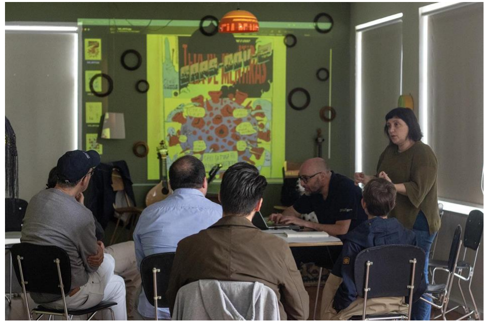
Figure 11: Image taken at the focus group, 2024.