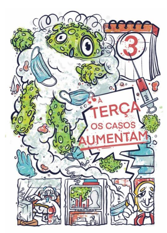
Figure 8: À terça os casos aumentam (On Tuesdays the cases rise!), Sara Duarte, 2024