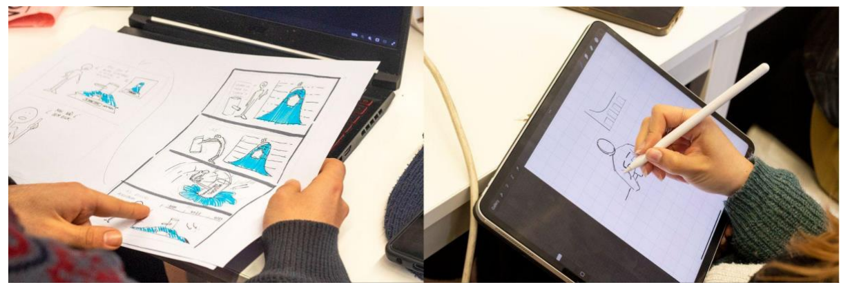
Figure 1: Images taken at the workshop - creative process, 2024

Main Concepts: The goal was to merge data-driven insights with artistic expression.