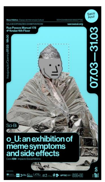
Figure 10: Poster of the exhibition, "o_U: an exhibition of meme symptoms and side effects", 2024