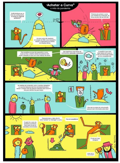
Figure 4: Achatar a Curva (Flatten the Curve), Guilherme Festas, 2024