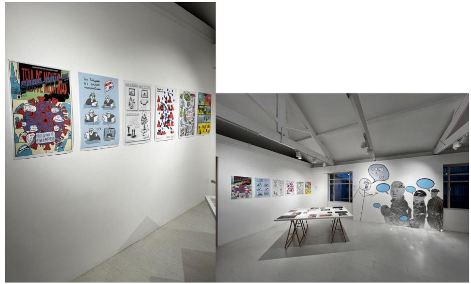
Figure 9: View from the exhibition "o_U: an exhibition of meme symptoms and side effects", 2024

A public exhibition titled "o_U: an exhibition of meme symptoms and side effects" was held at Maus Hábitos gallery, in Porto, Portugal, between the 7th and 31st of March 2024. This exhibition tested the viability of online-offline support in the subjective approach to public health policies, particularly in the face of growing misinformation phenomena. It explored possibilities of merging formal rhetoric with expressive content circulation and included the aforementioned student work along with various other pieces of diverse provenance along the overarching project.