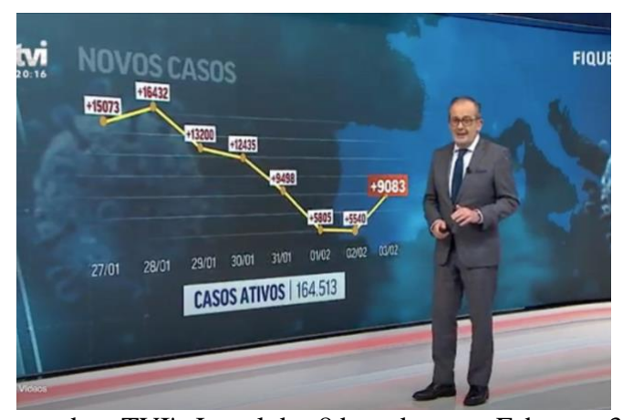
Figure 2: Graph presented on TVI's Jornal das 8 broadcast on February 3, 2021 at 8.16pm. The reporter remarked on the increase in cases (based on the previous day), stating that 'we still do not have a defined trend' (TVI and Carvalho 2021)

Television news programs often highlighted this sharp increase in cases without explaining that it was a result of the reporting cycle rather than a real surge in infections. Accurate analysis would require comparing the number of cases with the same day of the previous week or the total number of cases in consecutive weeks. However, this context was frequently missing from media reports, leading to public confusion. Daily reports from the DGS included charts that provided a more reliable analysis of trends, but these were often ignored by the media, which preferred to create their own, less informative charts (see figure 2).