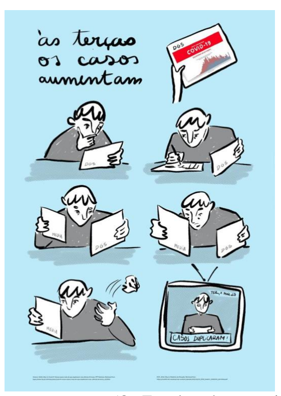
Figure 7: Às terças os casos aumentam (On Tuesdays the cases rise!), Marta Carrelhas, 2024

For "On Tuesdays the cases rise!", Luísa used a simple narrative in three panels, effectively conveying information with minimal ambiguity.