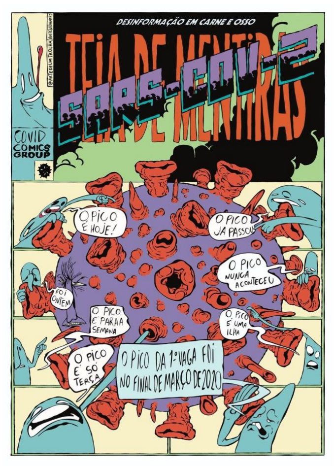
Figure 3: Teia de Mentiras (Web of Lies), António Amaro, 2024