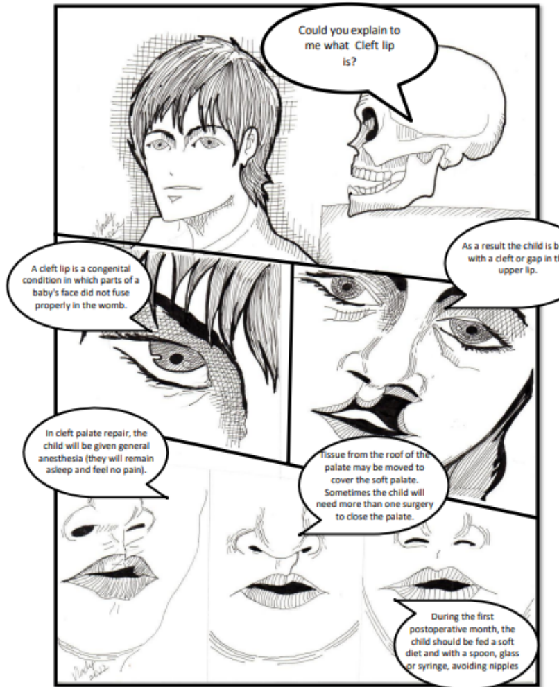
Fig 3. The Sancoyoc explains parts of mouth and student explains what is the surgical treatment of cleft lips.