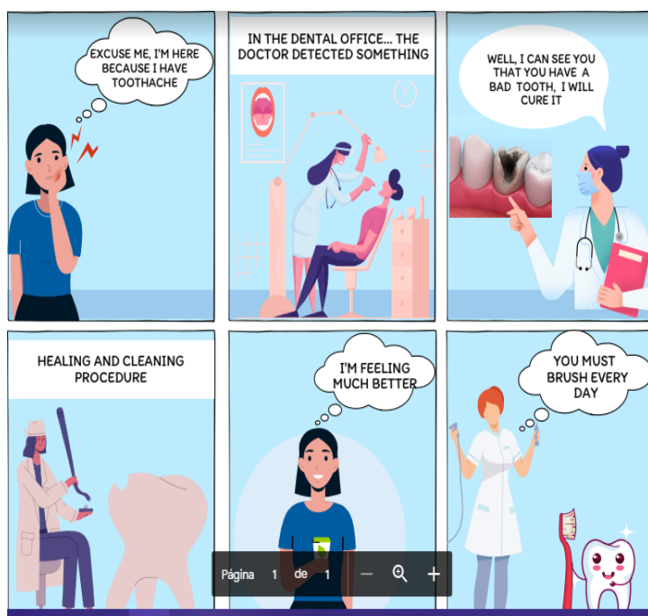
Fig 5. In all stories, there was the use of dental vocabulary and was noted student's motivation, even when they answered two questions about comics, they showed a favorable view about their use of them for learning English.