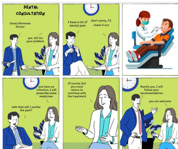
Fig 4. Every student created a comic strip, about a dental appointment, and the dialog between the dentist and the patient was recorded in audio.