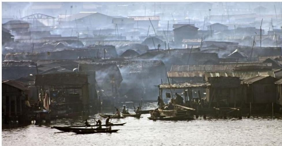
Makoko Lagos Lagoon Slum Development

Makoko, a fishing community which consist of dozens of stilt structures built over Lagos lagoon is habituated by very poor urban dwellers struggling to contain a rapidly expanding population (Bean, 2011). This slum settlement provides its residents with shelter to live and work with the lagoon serving as the main source of livelihood from the sale of fish to the rest of the city of Lagos. However, the government of Lagos has unfortunately identified the growth of this neighborhood as illegal and dangerous, as the unhealthy environment continuously expands causing water contamination and flooding as a result of the lack of sanitation and waste management.