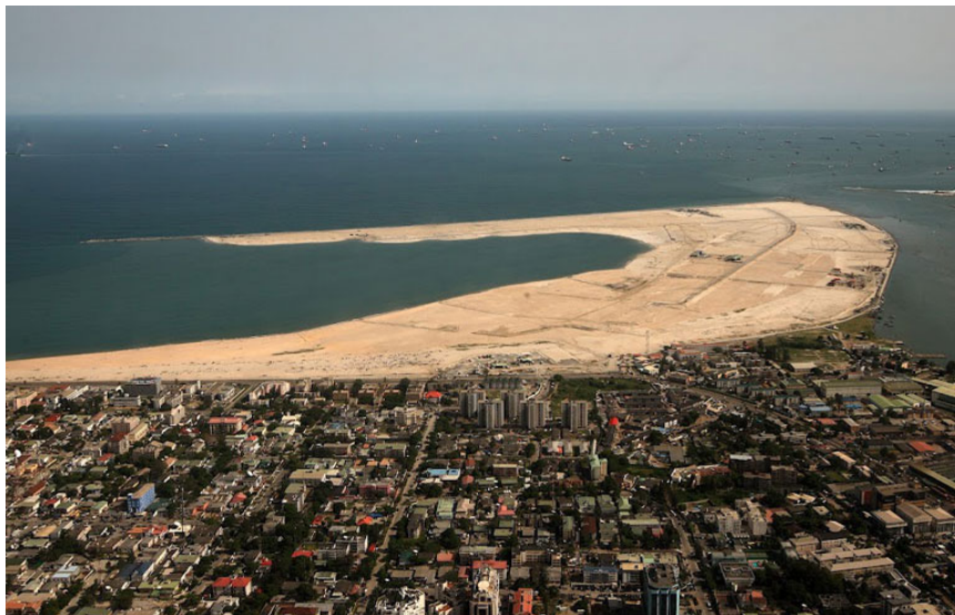
Land reclamation for the Eko Atlantic Project Lagos, Nigeria.