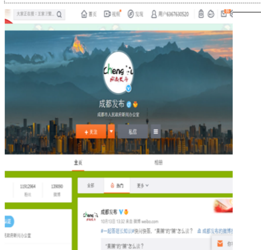
Fig. 9. @Chengdu Publication

The Chengdu Municipal Government created its official account on Weibo called @Chengdu Publication. It mainly publishes Chengdu government affairs and policy information. Meanwhile, it also publicizes Chengdu city to help with improving the image of Chengdu (Figure 9).