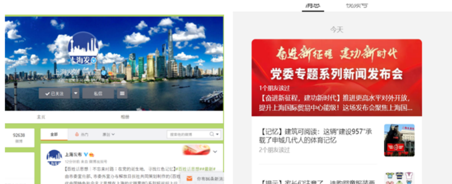
Fig. 1. The homepage of @Shanghai Publication (left) and Shanghai Publication (right).