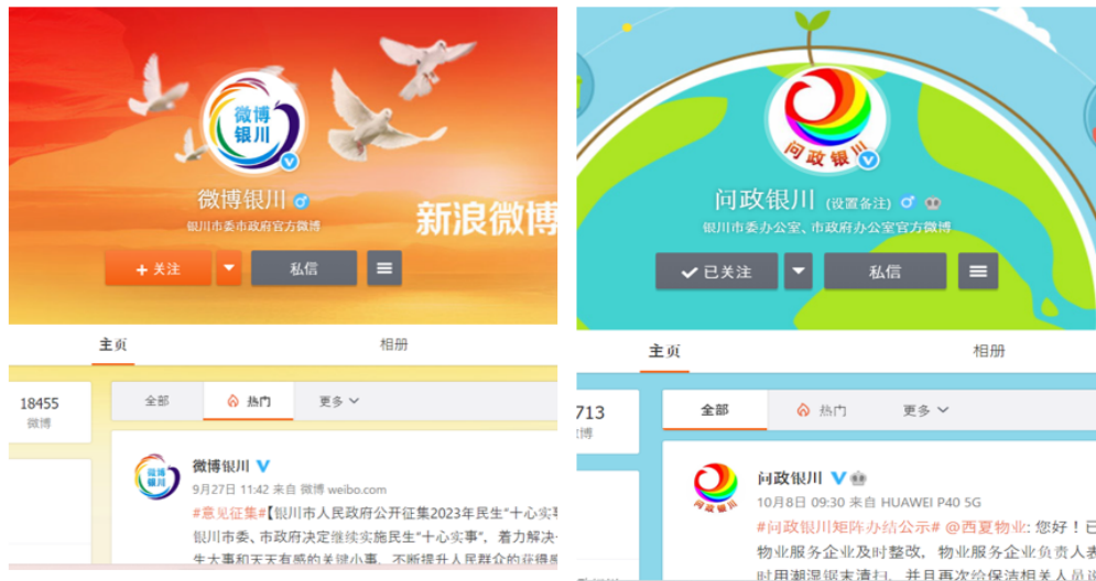
Fig.6. @Weibo Yinchuan (left) and @Wenzheng Yinchuan (right).