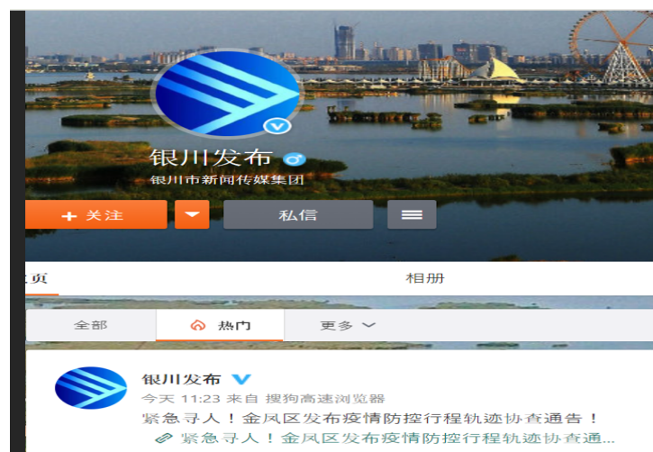
Fig.7. @Yinchuan Publication portal on Weibo

As the official Weibo account of the Yinchuan Municipal Party Committee Propaganda Department and News Release Office, @Yinchuan Publication mainly releases public service information to citizens, and meanwhile promotes Yinchuan, helping to improve the city's good image. As seen in figure 7, @Yinchuan Publication published an official announcement about the implementation of anti-COVID-19 measures for the public.