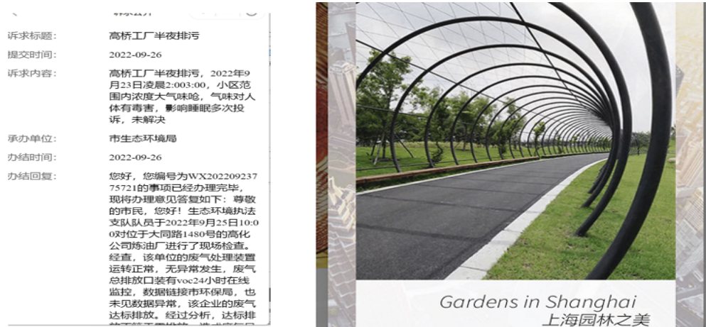
Fig. 5. Shanghai Publication's deal with citizens' complaints (left) and I Love Shanghai (right).

Furthermore, Shanghai Publication also promotes Shanghai from various aspects frequently, helping the Municipal Government and the city to establish a good social image. It provides a page named I Love Shanghai (picture right in figure5) that mainly publicizes Shanghai's traditional culture and city construction, food, history, etc.