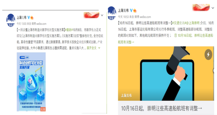
Fig. 2. #Latest News (left) and #Traffic Information (right).

As the Weibo official account of the Shanghai Municipal Government, @Shanghai Publication plays a role in releasing government affairs information by creating numbers of hashtags such as #Policy Analyzing, #ShangHai News, #Connect Districts and Counties, #Latest News, #Focus on Press Conference, etc. For example, the hashtag #Latest News published news about the Shanghai Municipal Digital Office issued the 'Shanghai Manufacturing Industry Digital Transformation Implementation Plan' on 8 October, 2022 (picture left in Figure 2).