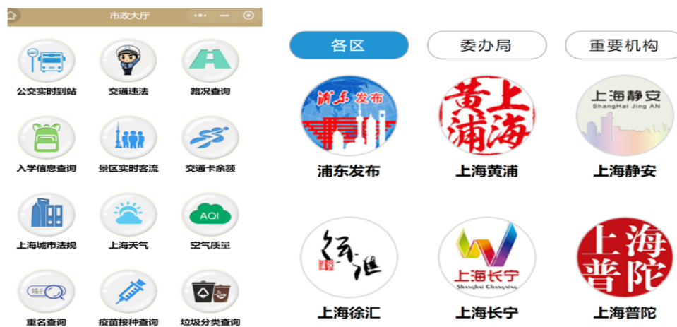
Fig. 4. Shanghai Publication provides public service (left) and publishes government information (right).

Also, Shanghai Publication always publishes government affairs information. It created a WeChat Matrix that provides access to Shanghai's 16 district official WeChat accounts, 35 bureaus accounts, and 33 official agencies' accounts (picture right in figure4). This WeChat Matrix provides an access route through which Shanghai governments at different administrative levels disclose information to the public.