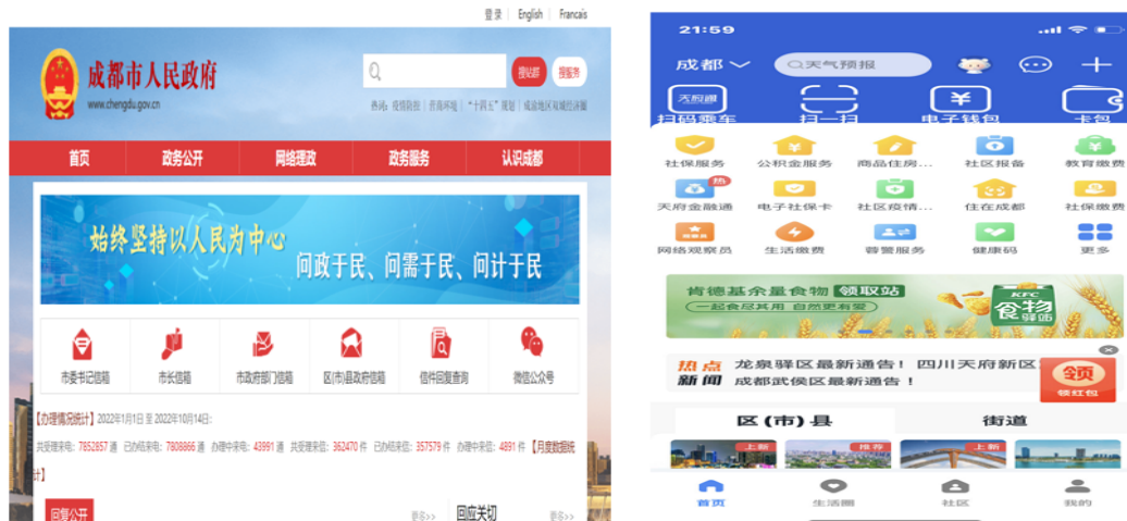
Fig.8. the Chengdu Municipal Government official portal website (left) and mobile application (right).

In 2016, the Chengdu Municipal Government of Sichuan Province created its own GSMP, which integrates various types of digital technology tools for government use. Such as publishing the mayor's mailbox and the CCP secretary's phone number on the government portal website, using mobile phone applications, and creating social media accounts. Figure 8, picture left demonstrates the Chengdu Municipal Government official portal website. In addition, Figure 8, picture right shows the mobile application created by the Chengdu Municipal Government, which mainly provides citizens with digital public services such as social insurance payment inquiry, personal tax payment inquiry, provident fund inquiry, and vaccination inquiry.