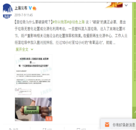
Fig. 3. #You Ask and I Answer