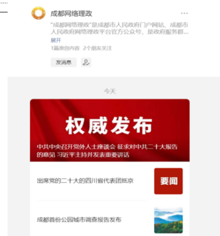
Fig. 10. Chengdu Municipal Government WeChat