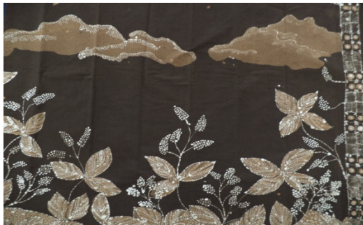
f. Motif of Parijoto