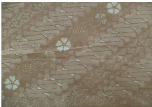
c. Motif of Parang Kembang