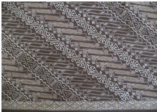
b. Motif of Parang Lereng