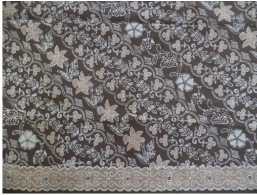
a. Motif of Parang Rusak