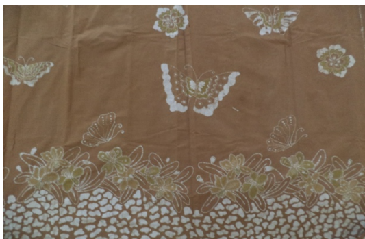
h. Motif of kupu-kupu, anggrek, dan batuan vulkanik (combination of butterfly, orchid, and volcanic rock)

Even though some Merapi batik motifs tend to be mainstream, such as Parang Rusak, Parang Lereng, and Parang Kembang, and also Kopi Pecah (broken coffee), but there are motifs that are the mainstay of the Canting Merapi batik community. These motifs