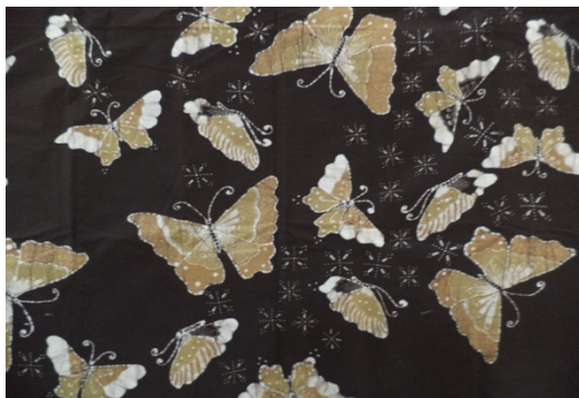
g. Motif of Kupu-kupu (Butterfly)