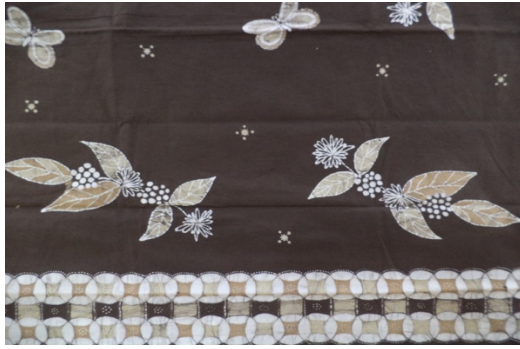
e. Motif of Kembang Kopi Lereng Merapi (the flower of Merapi Slope Coffee)