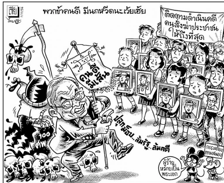
Figure 1: Cartoon drawn by Sia

In this image, Suthep is holding a flag with Thai cabalistic writing and a phrase, 'Good guy with privilege'. He says 'We're good guys. We have whistles.' Behind him, there is a grim reaper with the word '100 dead bodies'. In front of him, there are words which say 'lead a rally, overthrow the government, overthrow a case'. On the right side of the picture, there is a group of people who are probably relatives of the people who died during the protests against Abhisit's government. They are holding photographs of their deceased relatives and a poster with a message that can be translated into English, 'Do not forget the case of ordering the police to kill people'. At the right bottom of the picture, there are two mice who say, 'A bad guy wants to be a hero' and 'Karma will come'.