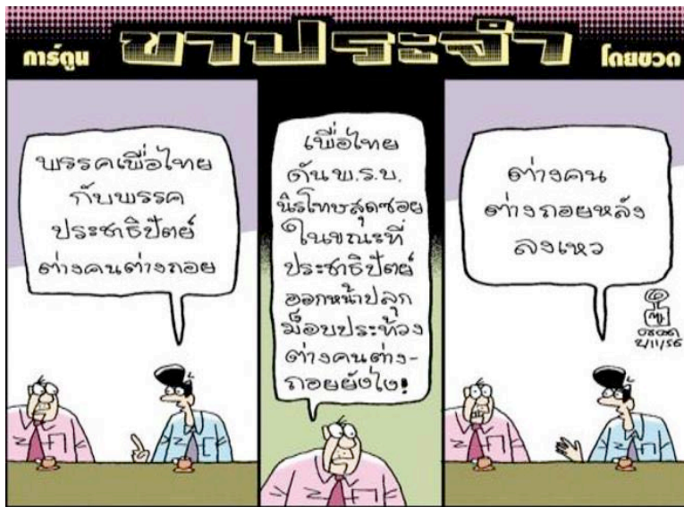
Figure 3: Cartoon drawn by Khuaid

The dialogue can be translated as follows: