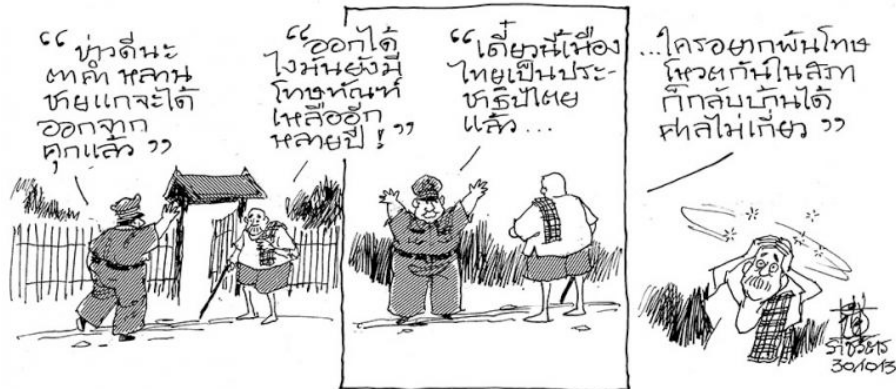
Figure 2: Cartoon drawn by Chai Ratchawat

The dialogue can be translated as follows: