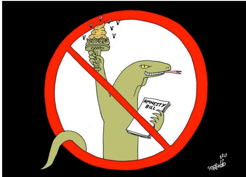
Figure 4: Cartoon drawn by Stephane Peray

In this image, a monitor lizard, a symbol of bad things for Thai people, is posing like the Statue of Liberty. He is holding the amnesty bill in one hand while another hand is holding a torch; however, there are feces in the torch. Moreover, the feces are surrounded by flies indicating that they are stinky. The flies in the image are used as an index for bad smelling because it is commonly known that flies like swarming around things with bad smelling. In addition, there is a red circle with a crossing line around the monitor lizard. It is generally used as a sign of prohibition.