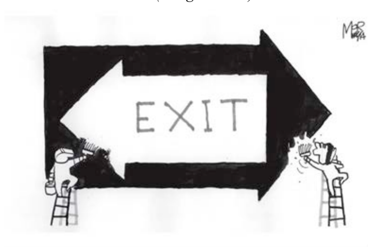
Figure 6: Cartoon drawn by Mor

This image shows two men are painting an exit sign. The whistle-head man on the left is painting an exit sign indicating to the left; however, the foot-head man on the right is painting the same exit sign indicating to the right.