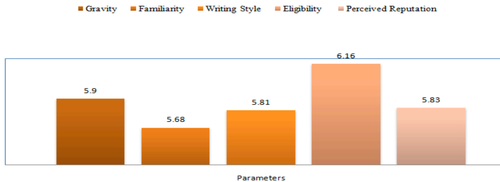
Chart 1. The frequency of the various parameters that influence credibility, as suggested by readers