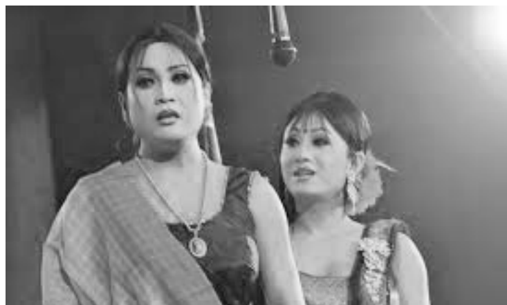
Figure 2: Nupi shaabis

Shumang Leela is popular for its Nupi shaabis who are actually male actors performing female roles. Owing to the nature of the theatre form, actors had to travel to different places for performances. Manipuri society being conservative in nature, did not find it conducive for women performers travelling with men to distant locations. Hence, there was a dropout in the number of women performers and men had to step in to play the female roles. Nupi shaabis have to undergo rigorous training in the practice of physicality and vocal skills. The practice generally was that the Director of a troupe would look for suitable boys and seek the parents' permission to train the boy as Nupi shaabi. Upon getting the consent of the parents, the boy would be consecrated on an auspicious day at the teacher's residence. The induction would first start with habituation of household chores done by women so that they are type-casted into the feminine nature. It is only after they have perfected themselves in this role that the real acting in terms of dialogue delivery and feminine movement are taught. Throughout this grooming stage, the future Nupi Shaabi is treated as a daughter. Here again, there is the power play of a patriarchal notion of how an "ideal" woman should be. This "ideal construct" of feminine disposition as perceived by a patriarchal society leads into the transformation and construction of a Nupi shaabi.