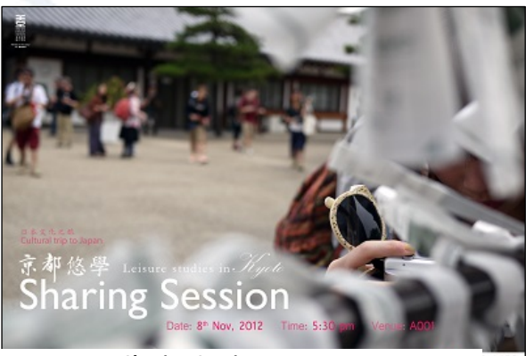
Sharing Session Poster

In keeping with the nature of the rest of the trip, we encouraged the students to take the lead. They responded remarkably well and created an entertaining and comical play based on memories and observations from the trip. In this role-play, they reenacted a dream about the Kyoto trip with one of the students playing the part of a