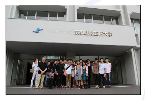
Group photo outside Saga University

was an opportunity for them to get to know each other. This gift exchange was conceived as an icebreaker. The students were asked to prepare something, not too expensive, which had some connection with or represented some aspect of Hong Kong culture, as they perceive it. The trip team purposely did not instruct them on what type of gift to prepare so that they had to consider the choice along with the knowledge that the local Japanese students would be preparing a similar kind of gift to give in return.