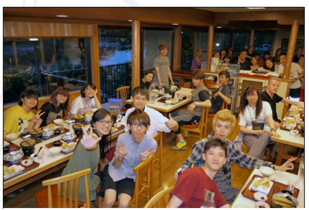
Harmonious group dinner at Ujikameishiro

The accommodation that was found was in the style of the Ryokan guesthouses found around Japan and was large enough to host the entire student group. There were two linked blocks and we were able to arrange