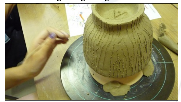
Student Aaa's pottery design 'Forest'

Before leaving Hong Kong all the students had been briefed on details of the pottery