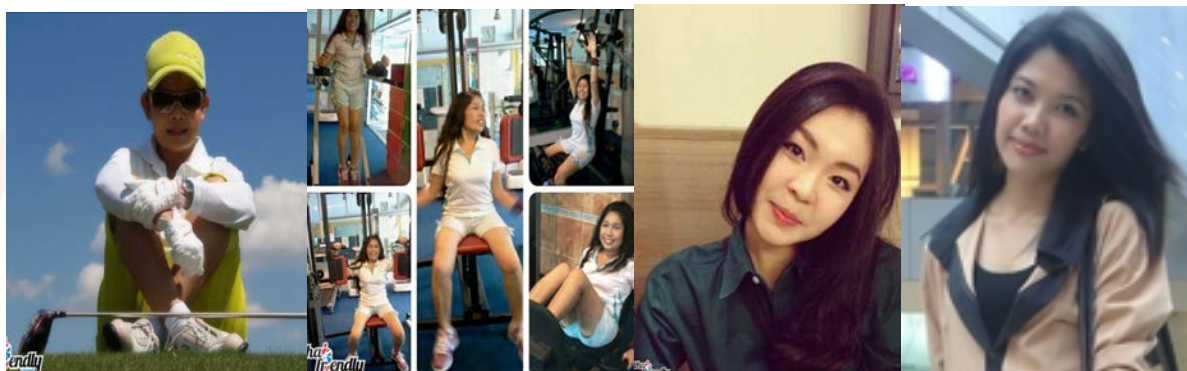
Sample of confident and active women

4. The photos of women who love animals where the members took a photo with pets such as dogs or other animals, and taken to express that they love animals.