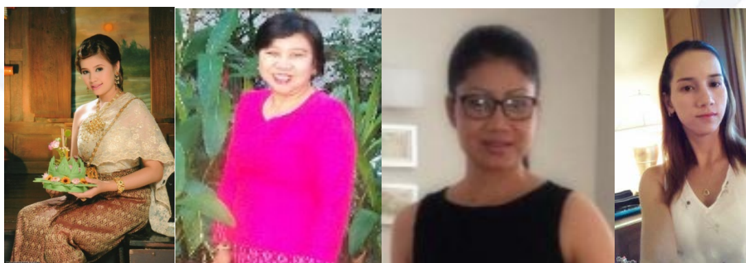
Sample of women who had housewife character

The photos of members that they used for presenting themselves to foreign men found that most were the photos of beautiful sweet, lovely, bright women, who