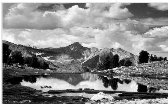
Figure 1: Kings Cayon National Park