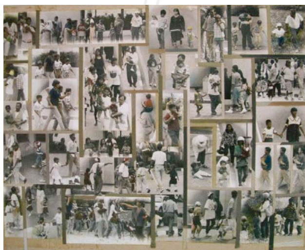
Figure 4: 'Sayang Anak ( Love the Children)'