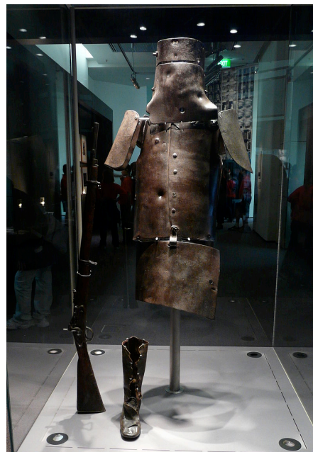
Image 2: Ned Kelly’s Armour, for the Siege of Glenrowan, in Glenrowan, Victoria (1880).