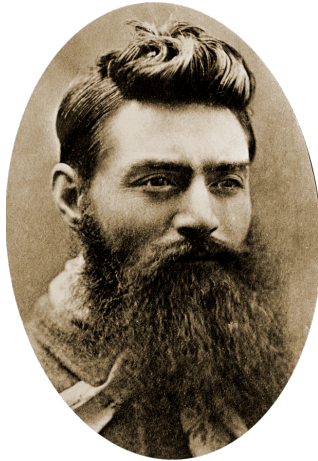
Image 3: Ned Kelly, 25-years-old, Melbourne Gaol, Victoria (1880).