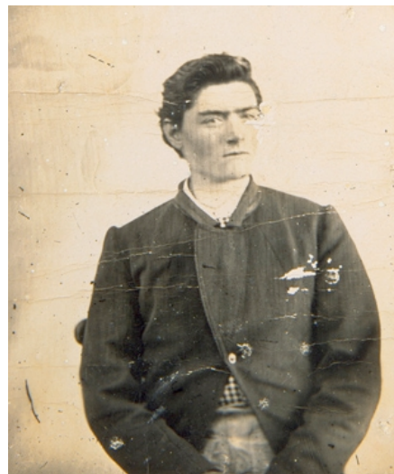
Image 1: Ned Kelly, 15-years-old, in Kyneton, Victoria (1871).

The colonial era – from 1788 until Federation in 1901 – stood witness to an astonishing array of crimes committed; from petty thefts to brutal murders. Yet, in a line-up of all the Australian criminals, who sparked fear across the colonies and generated business for the law and justice systems in the colonial era, no individual stands taller than Edward 'Ned' Kelly of Victoria (a colony south of New South Wales). Of all the bushrangers, it is Kelly who maintains a prominent place within Australian history as a cultural and popular icon. This situates Kelly, and his Gang, alongside many other bushrangers. Men who robbed, raped and murdered their way across the Australian outback in the eighteenth and nineteenth centuries; criminals (sometimes referred to as banditti) who sought refuge in the bush. Men who now, in several cases, are heroes of folklore.