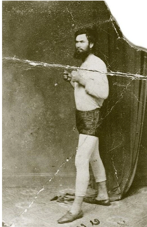
Image 4: Ned Kelly, 19-years-old, in Beechworth, Victoria (1874).