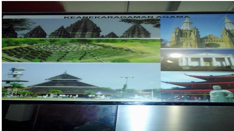
Figure 2. Religious Plurality in Indonesia as Represents at Diorama Sejarah Perjalanan Bangsa

According to the illustration that shown in figure 2, we could could understand that the archival institution has drowned under the wave of administrative plurality as state defined. The position taken by archival institutions in favor of the administrative plurality narrative indicates that archival institutions are not sensitive to the sociological reality where archival institutions that grow and develop. It also became one of the reasons why the use of religious archives has not performed optimally by archival institutions. It has also somewhat affected the position of archival institutions that are less popular in the public.