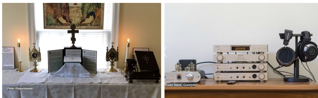
Figure 3: Altars of Worship

Modern audio has not eschewed this. Portable digital audio players have made a resurgence in the audiophile world, with brands like Astell&Kern creating obelisk-like offerings, and headphone listening desks can have stacks of audio components that mirror the hi-fi listening rooms of yore, just on a smaller scale, as seen in Fig. 3 below.