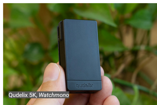
Figure 1: Miniaturization

In addition, tweaking on the “software” side has become more popular, particularly with equalization. While in the past, equalization was accomplished with a large, rack-mounted box with physical sliding tabs to control frequency response at particular ranges, now it can all be done through software on a portable amplifier the size of a lighter, or even on a smartphone app or through the internal circuitry of wireless earphones/headphones.