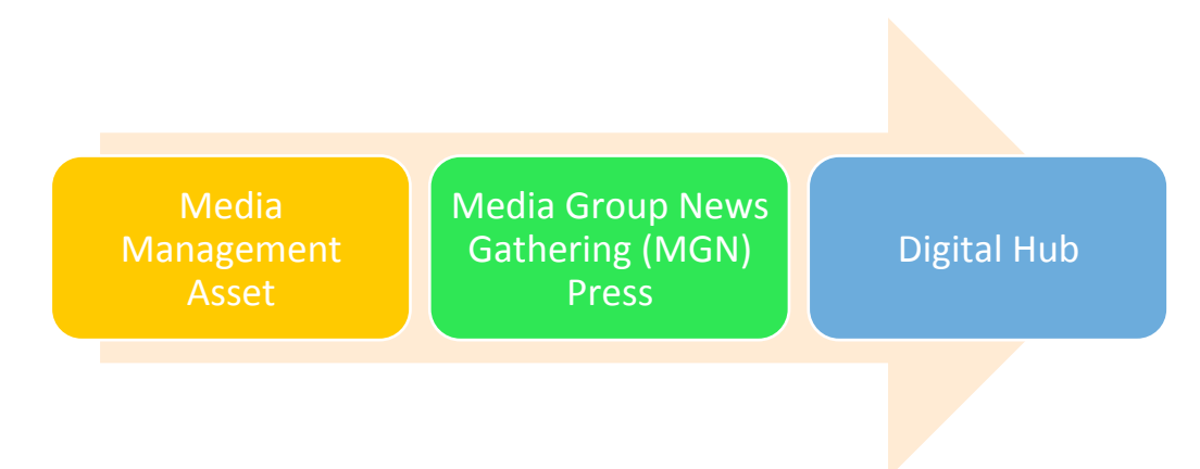
Figure 1: Three Digital Transformation Strategies in Media Group Network