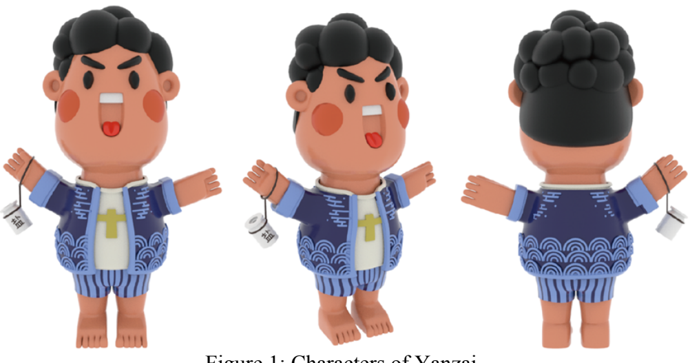
Figure 1: Characters of Yanzai

Yim Tin Tsai in Hong Kong is just such an aphasiac village. Under the trend of emigration and moving home, this small Hakka island that once converged excellent Chinese and western cultures has turned into an abandoned village. Fortunately, the revitalization of the countryside and the rise of cultural tourism have restored some vitality to this village. However, there are still some problems that have not been resolved so that its development is not perfect. Therefore, this paper regards Hong Kong Yim Tin Tsai as the research object and starts with the revitalization of the village. Reference eco-museum, cultural tourism IP and other concepts. Moreover, the paper puts forward more scientific and completes development suggestions for Yim Tin Tsai