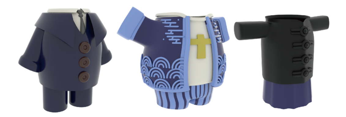
Figure 2: Clothing Design of Yanzai