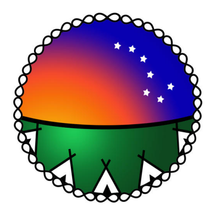
Figure 1: AIM -HI logo

The Alberta Indigenous Mentorship in Health Innovation (AIM-HI) Network Local-to-Global Indigenous Service-Learning Field School was created to foster emerging Indigenous Health Research success with five Indigenous post-secondary students. The AIM-HI Network (Figure 1) is one of eight Canadian Institutes of Health Research (CIHR) funded Indigenous Mentorship Network Programs, with a mandate to support Indigenous graduate students engaged in health research. The AIM-HI Network specifically embraces an intergenerational, multi-layered, and cascading mentorship model, with a commitment to identifying supports for success and resilience of Indigenous learners and through wise mentorship practices.