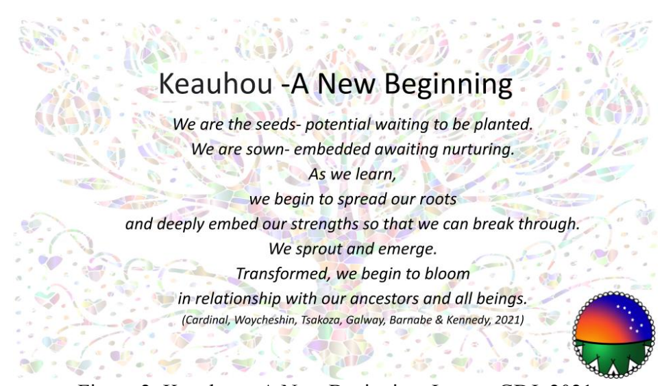
Figure 2: Keauhou - A New Beginning