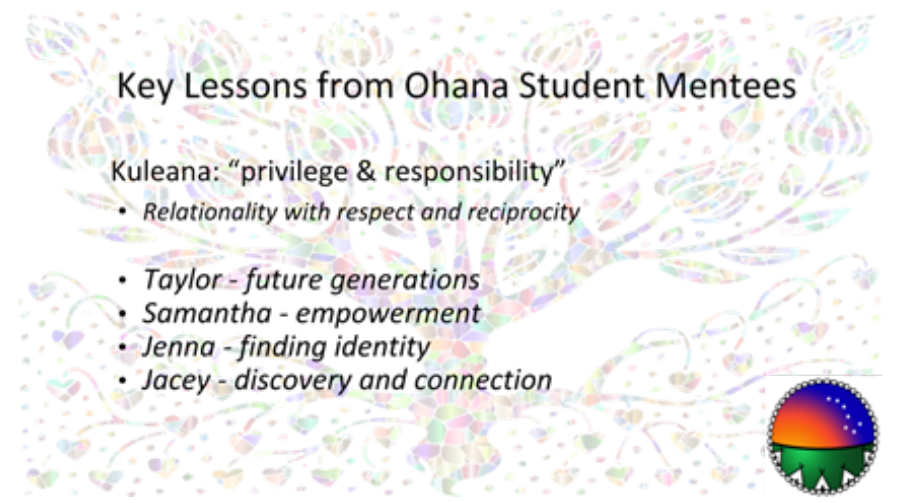
Figure 4: Key Lessons from 'Ohana Student Mentees