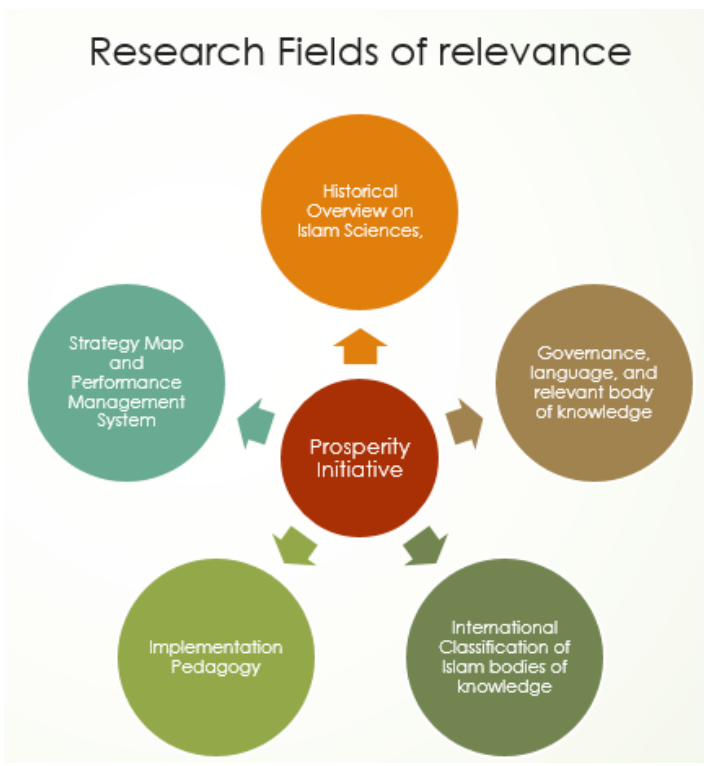
Figure 3: research areas undergoing by the author

The author herein summarizes the initiatives required to be in action for this program (mega project) to take place and following is this representation: