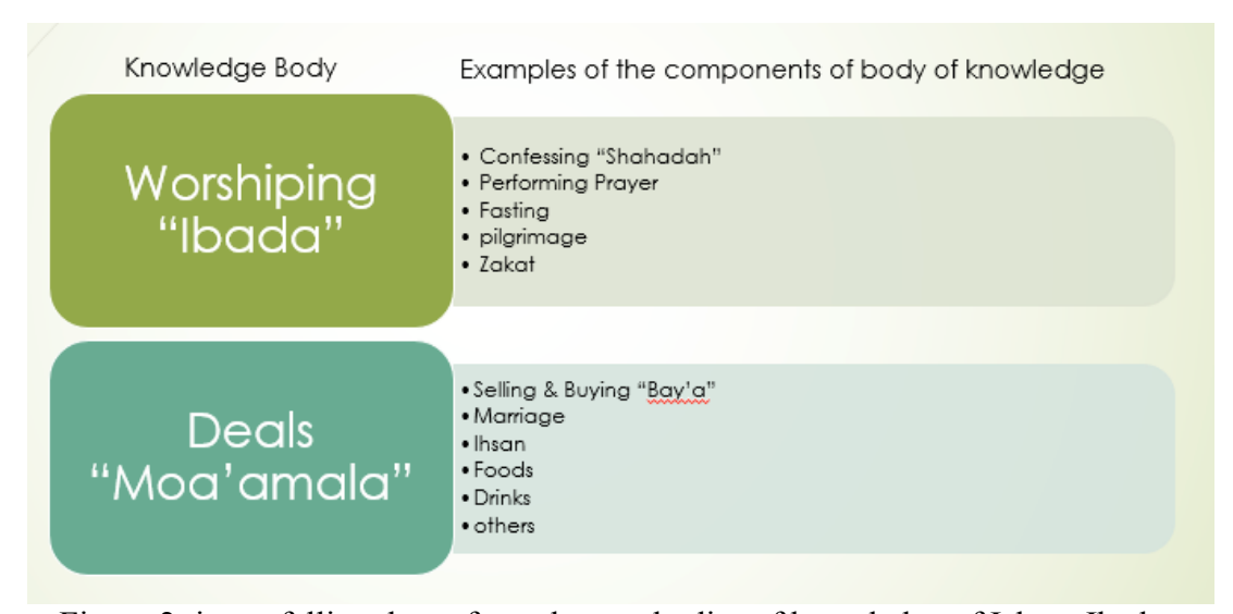
Figure 2: items falling down from the two bodies of knowledge of Islam: Ibadat, Moa'amalat.

(Ibada) as stated herein in figure 1 is a singular of (Ibadat), as (Moa'amala) is of (Moa'amalat). The main items falling down from each (Ibadat), and (Moa'amalat), are presented in figure 2 hereafter.