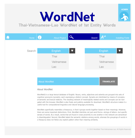
Figure 1: Example of Interface