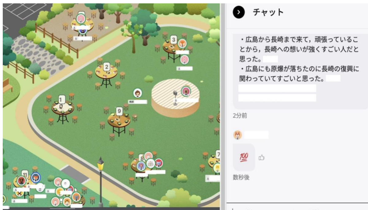
Figure 4: An example of a screen in practice using the 2D-Metaverse

items and the median score of 3. This analysis revealed a predominantly positive response from the majority of participants across all 11 items.