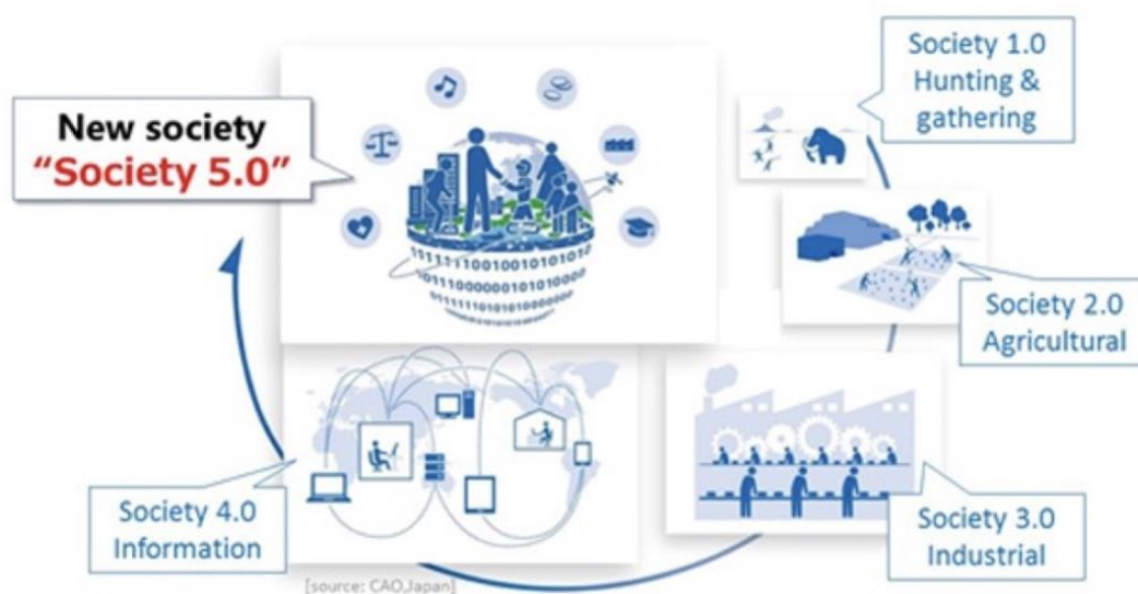
Figure 1: Conceptualization of Society 5.0 (Cabinet Office 2024)

Society 5.0 is conceptualized as a human-centric society that harmonizes economic progression with the amelioration of societal challenges through a framework that intricately intertwines cyberspace and the physical realm. This concept was introduced in Japan's 5th Science and Technology Basic Plan as the envisaged future society, succeeding the chronological progression from the hunting society (Society 1.0), through the agricultural (Society 2.0), industrial (Society 3.0), to the information society (Society 4.0). A quintessential example of the fusion between cyberspace and physical reality is the metaverse. The metaverse holds immense potential for transformative educational practices in this contemporary epoch. Figure 1 shows the conceptualization of Society 5.0.