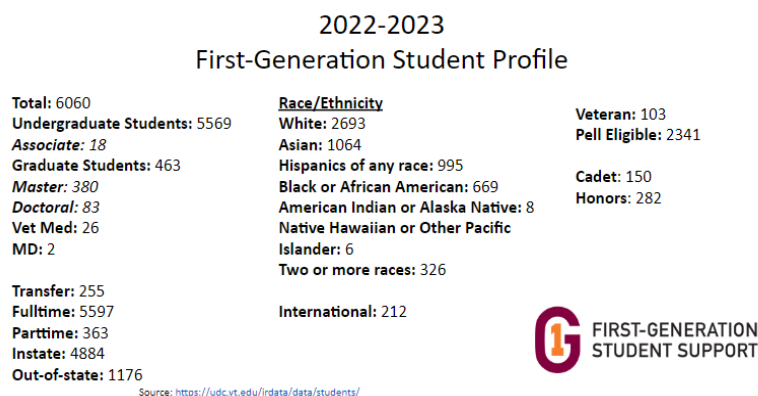
Figure 1: Demographic breakdown of the first-generation students enrolled at Virginia Tech between August 2022-January 2023.

At Virginia Tech, a student is identified as a first-generation college student if neither parent/guardian has earned a bachelor’s degree at a four-year college or university