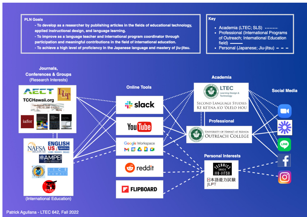
Figure 4. Personal Learning Network Example.