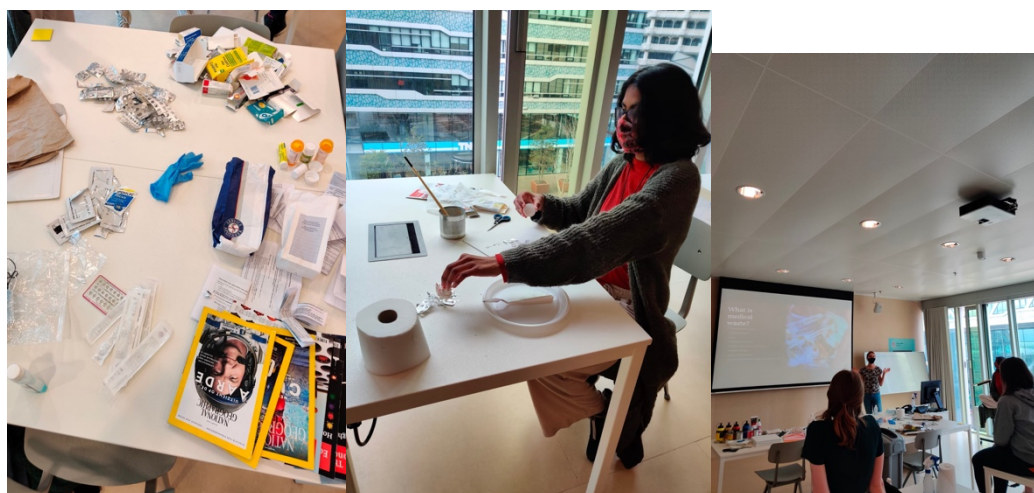
Fig 2. Art workshop on medical waste

After interacting with the content and activities in the modules, the students devised their investigation and implemented it in their schools or communities. The students recorded their results and experiences in various forms (e.g., videos, PowerPoint presentations, art exhibitions). These artefacts were uploaded to course module web platform by the instructors for access by peers. The instructors gave feedback about the artefact through the platform and other design thinking platform applications (e.g. Mural). One group of students investigated waste discarding behavior of their peers in the dormitory setting and held an art workshop of the medical waste during Covid-19. Here they identified various types of medical waste and considered how they were discarded. From their workshop they concluded the awareness efforts in their community were effective(Fig 2).