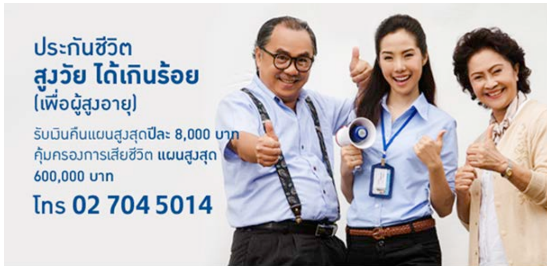
Figure 6: Advertising often portrays older adults in a positive light. This insurance ad shows a happy and active Golden Ager stereotype using the product and services.

Increasingly, older celebrities are seen endorsing products such as health products, food, drinks, financial services, household items and home improvement services. Advertising which makes use of the grandparenting relationship to sell products, along with an active ‘golden ager’ stereotype is also burgeoning.