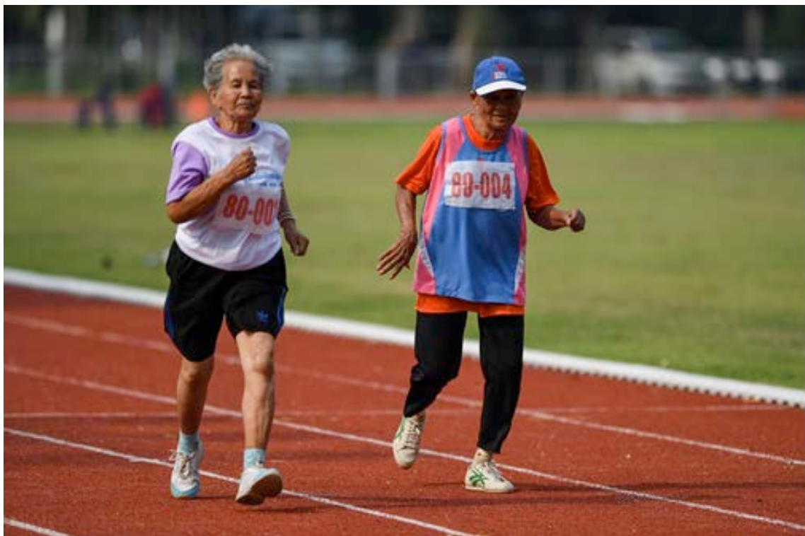
Figure 4: Women in the 80-85 age category running the 400 meters race.