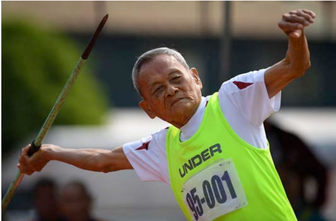
Figure 3: Thailand's first National Elderly Games held in April 2018. The news reported that the government organized this event with the aim of boosting healthcare among seniors, with the added social draw of competitors enjoying the opportunity to meet friends.