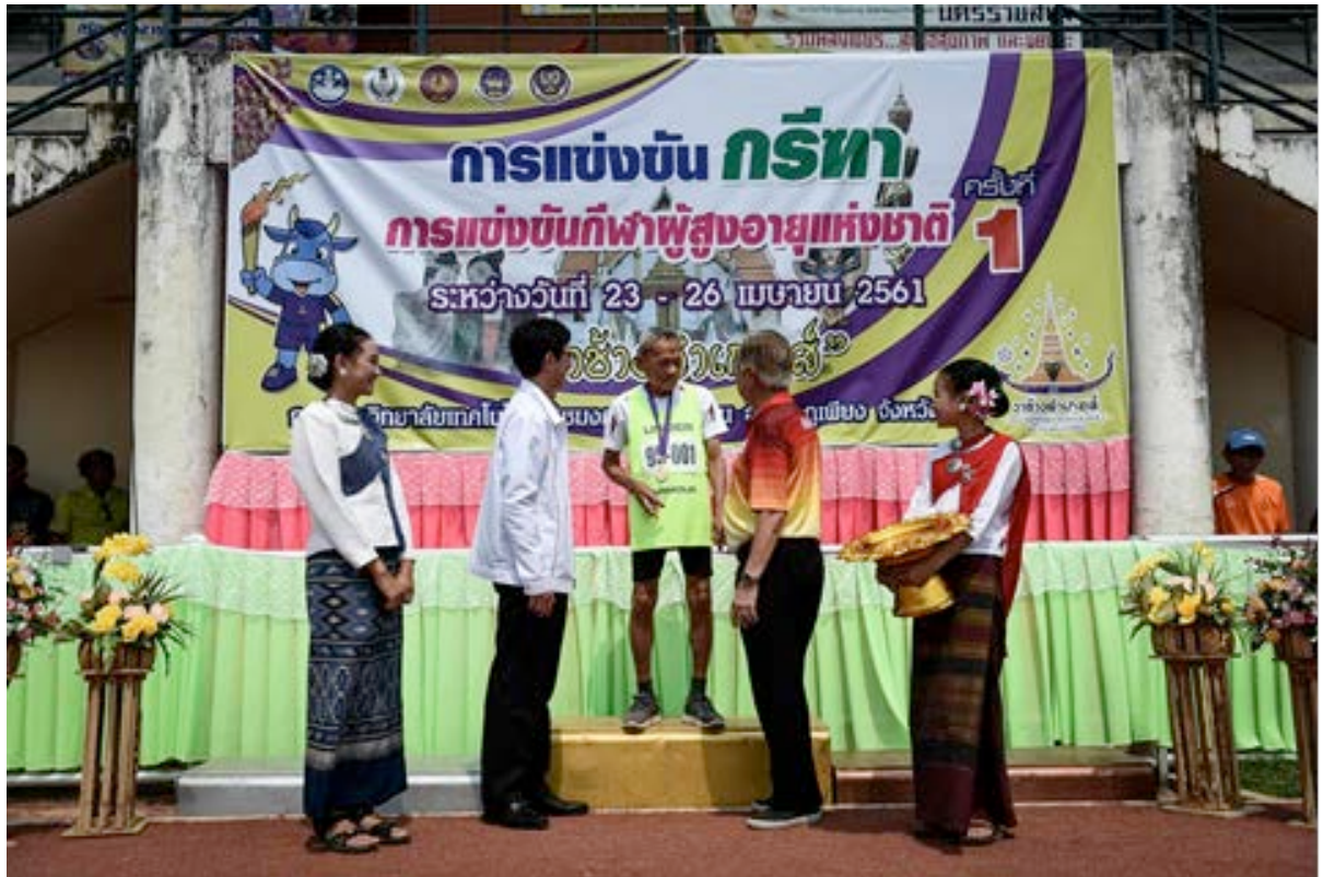
Figure 2: Thailand's first National Elderly Games held in April 2018

An example of this argument can be seen in the news reports built around Thailand's first National Elderly Games. As shown in the picture below, the government initiated the event to promote the health of the elderly by organizing Thailand's first National Elderly Games in April this year (2018). The older participants were portrayed as passive agents who needed social care and support to boost their health rather than active agents who keep themselves fit and strong.