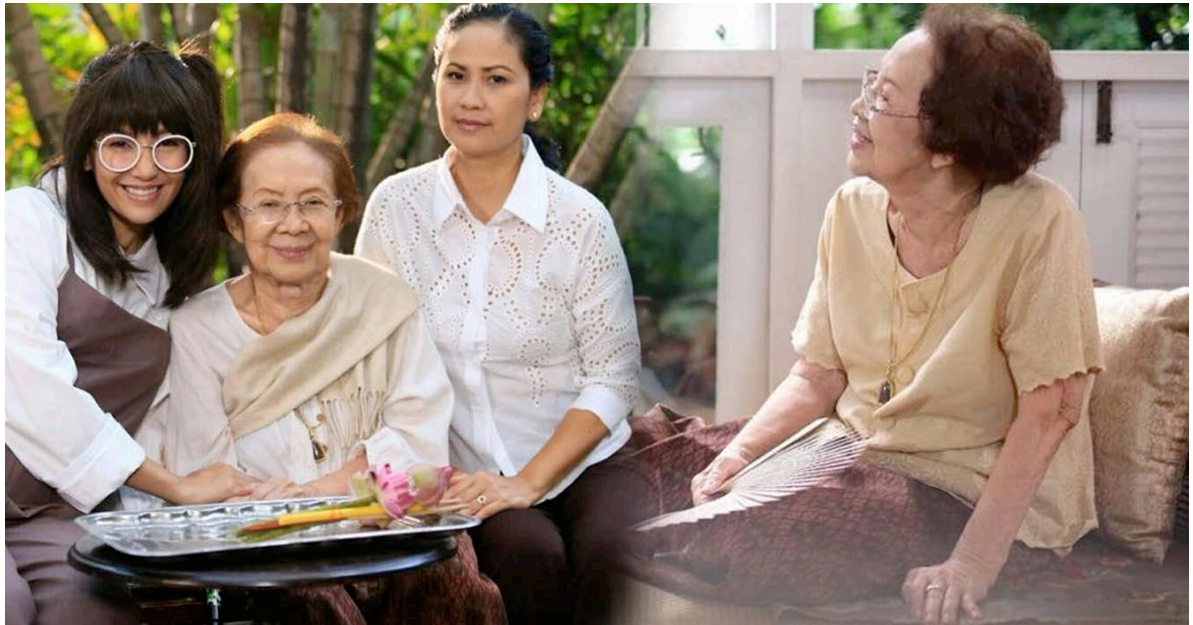
Figure 1: Older characters in a drama program representing Thai tradition and cultural values. In this picture the grandmother, the elderly female actress second from left, was preparing a Buddhist ritual of alms-giving. The drama conveys the message of the tradition being passed from the older to the younger generation of the family.

of the television drama program. It is a tradition for the production team to honor the senior characters starring in the show by addressing their names at the beginning of the program titles and introducing them with the title of honorable actors.