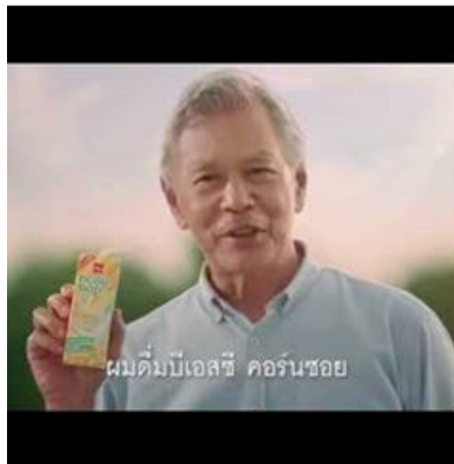
Figure 7: More senior celebrities are seen endorsing health products on adverts. Discussion: Images and Representation of Older Adults on MSM

Hummert and colleagues (1994) examined the portrayal of the elderly in Television adverts and classified two stereotypes, namely the Perfect Grandparent who is kind, loving, and family oriented, and the Golden Ager who is lively, adventurous and alert. Later, Williams (2010) applied these stereotypes as a coding system to study UK magazine adverts. His study came up with the six stereotypes of elderly, labelled as: Golden-ager , Perfect Grandparent , Legacy/Mentor Themes , Coper , Comedic , Celebrity Endorser .