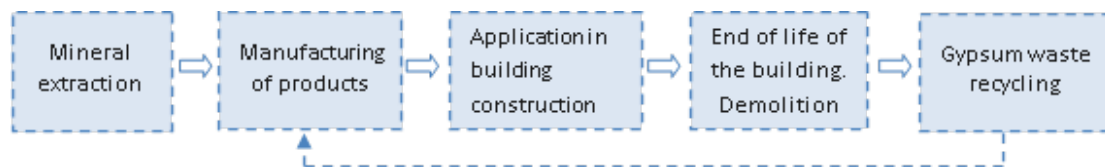
Figure 2: Plasterboard value chain integrated approach.

As specific objectives, the following must be highlighted: