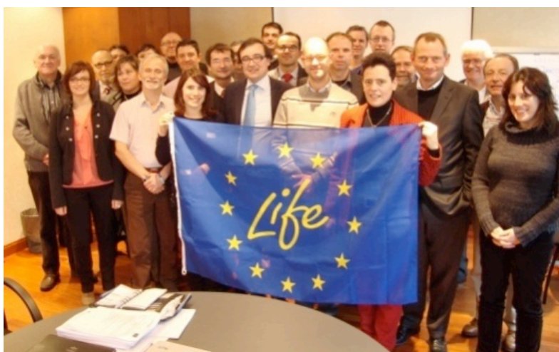
Figure 1. Representatives of the GtoG project consortium during the kick-off meeting.

The GtoG project “From Production to Recycling: A Circular Economy for the European Gypsum Industry with the Demolition and Recycling Industry” , is co-financed by the Life+ Programme of the European Commission. It started in January 2013 and will finish in December 2015. The participating consortium is coordinated by Eurogypsum, European federation of national associations of gypsum products manufacturers, and consists of 17 partners (2 universities- 5 demolition companies-1 consultant in deconstruction- 5 gypsum manufacturers-1 laboratory- 2 recyclers) from seven European countries (Figure 1).