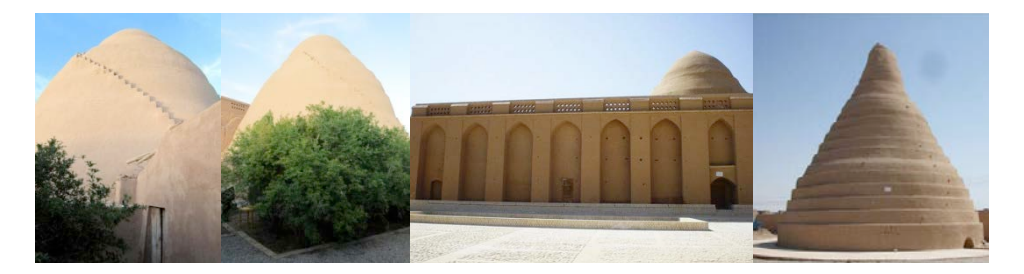
Fig 2. Domed Ice-pits in Meibod and Abarku, Yazd, http://graphic.ir, http://dadaryha.com, [5]

Fig 1. Left, Meibod Ice-pit in Yazd, this structure with a height of 15m is one of the tallest ice-pits in the city. Right, shading walls in the examples from Yazd [5].