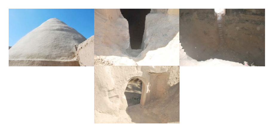
Fig 3. An ice-pit in Kashan, Dome, hatch and ice reservoir are shown, photos by Korsavi.