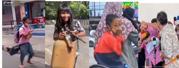
Figure 4: shows the origin of the words " Tua Tueng ( The tight one)".

That speech then became humorous viral and reached 8 million views. Many tiktok users has used this speech and sound to their own clips. Most of them are video clips of people who are so heavily drunk that they can't control their mind. However, “full carabel” can be used in a variety of ways without limitation, for example, you can use it when you go to a party asking everyone to have fun and say, "It's full carabel today," or when your friend vomits as "I told you not to full carambel," and if you're having a full meal, they'll say, "It's full carabel for this meal." etc. (TNN Online, 2023).