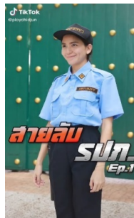
Figure 1: shows the origin of the words: Chan Pen Prathan Borisad (I'm the president of the company)

From observing and monitoring the use of Thai words that appeared on social media between 2021 and 2022, it was found that there were many famous people in the society (Influencer) using words that went viral. But in this article, the researcher selected Thai words that are viral, catchy, polite, and not related to politics, religion, or belief and has been widely popular to study, analyze and compare with the correct use of language according to the principle as follows: