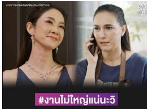
Figure 5: shows the origin of the wording. “Ngan Mai Yai Nae Na Vi ( Is it definitely not a big deal, Vi?”