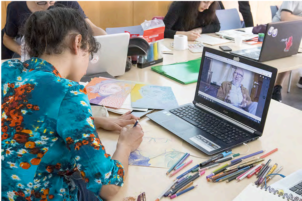
Figure 5: Classroom workshop carried out at the School of Fine Arts of Porto, June 2019.

interview archives created. Art and Design students are being invited to explore new visual repertoires that offer a critical eye of this new generation on the heritage of knowledge of retired art and design professors through illustrated essays, typographic works, graphic novels, among other graphic approaches. In these workshops a set of the most valued pedagogical methodologies practiced in the 1960s and 1970s are being recovered, among them, the studio regime; the combination of students from different artistic fields and with different backgrounds; an experimental approach to the proposals with the combination of handcrafting processes and current digital media (figure 5).