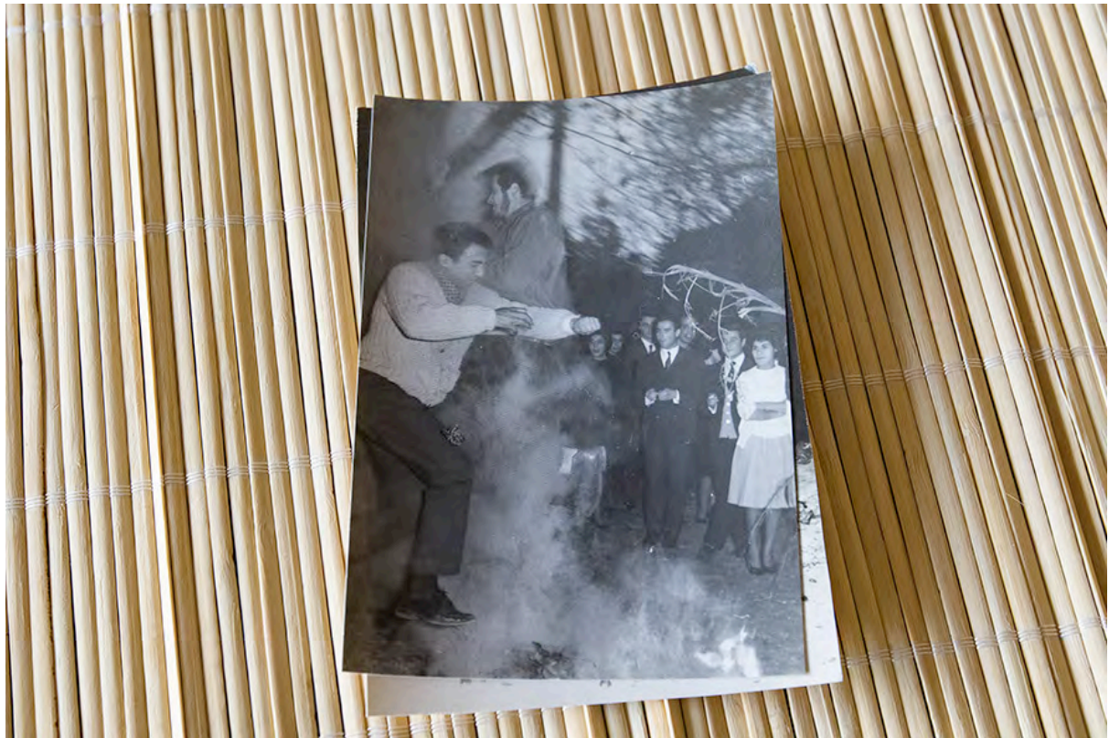
Figure 3: Magusto, 1961: Bonfire Jump.

Furthermore, the fact that access to information was limited also provided the conditions for a closer relationship between those who attended the school. The access to information and artworks was partly done through the school's library which was small and did not have a large variety of bibliography. As reported, the books were mostly related to past art forms (such as Romanticism) failing contemporary art references. There were mainly works of Art History and Anatomy, usually in French. The reproductions of paintings in these books were often of poor quality and in black and white. Students could also resort to the city bookstores, but the books of art sold there were few and quite expensive. In this sense, it was common for professors to take their own bibliography to show and even lend to students. José Paiva recalls the example of Joaquim Matos Chaves, who not only brought his books to school but promoted discussions often “in the convivial ground outside class” (personal communication, December 19, 2018). Carlos Carreiro recalls the postcards with reproductions of Morandi that Ângelo de Sousa took to class. And Manuela Bronze remembers seeing “with passion the slide passages” presented by teachers with works of art she had never seen before (personal communication, January 4, 2019).