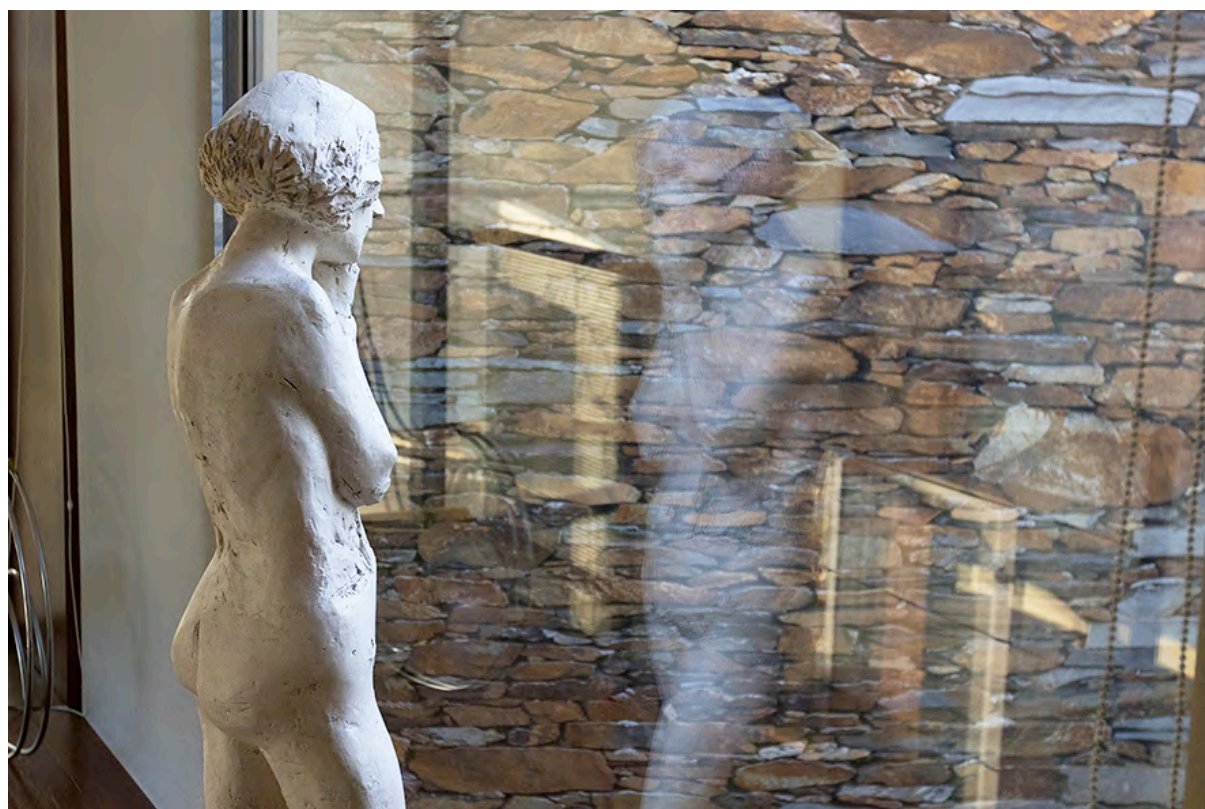
Figure 4: Sculpture by Carlos Barreira for the Aggregation Exam of the Sculpture Course in 1973.

As a general rule, there were no exchanges with other schools, with lectures mostly confined to the School of Fine Arts of Porto. As an exception, visits to the Anatomic Theatre in Hospital de São João were made within the context of Artistic Anatomy, constituting valuable learning resources for the visual representation of the human body, whether in Painting or Sculpture. This was highly appreciated by students. Artistic Anatomy was then lectured by a doctor, who gave them notions about bones, joints and muscle mass. As reported, the contact with the corpse in the Anatomic Theatre helped to understand the fittings of bones and joints. It was not intended a very deep lecture in the study of the corpse, but the knowledge of the anatomy through drawing. This learning experience was especially important for those who chose the Sculpture Course, since the practice of human body sculpture was an essential part of the program and of the Aggregation Exam for those who aspire to become teachers of this course (figure 4).