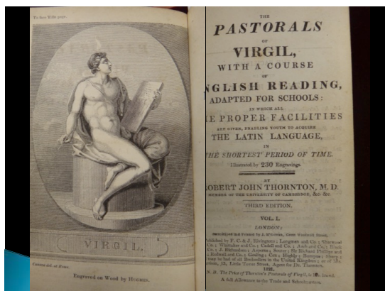
Frontispiece & title-page of Thornton's Virgil (1821)