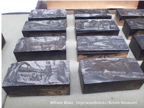
William Blake, Virgil woodblocks (British Museum)