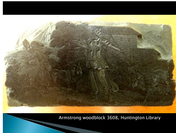
Armstrong woodblock 3608, Huntington Library