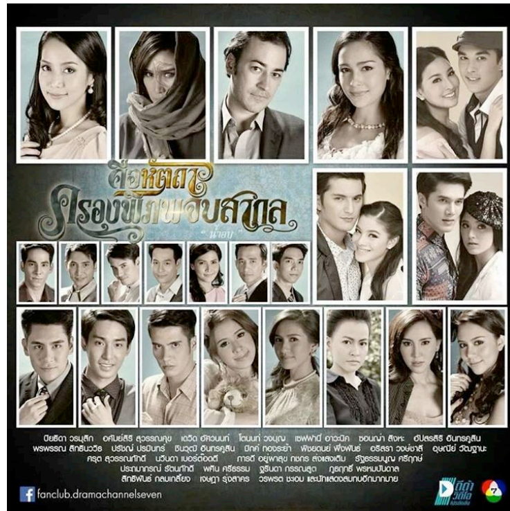
Figure 2 : “Kue Hattha Krong Pipope” Thai television drama.

Kue Hattha Krong Pipope Thai television drama accorded noble has ending part is Kue Hattha Krong Pipope Chob Sakol which story is focused on the family life of Phraya Smitibhumi who has 2 wives are Lady Sri and Saban-nga. Saban-nga was from lower class family so she tried to improve herself to new Lady in the house. This drama reflected the rearing of Thai people in that period and core content of this drama is reflection of attitude loving in motherhood, sacrifice, benefactress of mother beyond times. She has 2 daughters who are inherit ideology and attitude that believes happiness of women is motherhood. Prawpunnarai who is success in her family life with her husband and 4 children because of motherhood she is discreet when she knew that her husband has sexual relationship with others she can keep warm family with love. Prawpilas who is another sister, she has a child but he died because of her stepson she cannot protect but she attempts to protects Sean and ex wife (Mekla)’s son with mother’s duty .