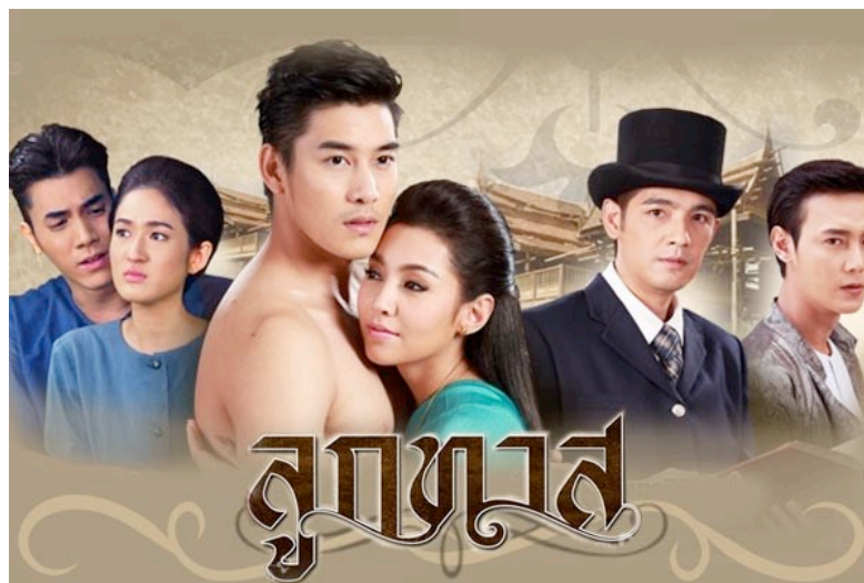
Figure 1: “Luk Tas” Thai television drama.

Luk Tas television drama was presented about slave content, indicated to difference among Thai social class in that period. In the past period, people were sold to be slave as goods they was no right and no freedom. They were sold to buyer as goods called “slave”, buyers like owner they have authority to control their slaves or can punished when their slave do something wrong. The slaves have to work hard and be sexual harassment. Producer of this drama attempts to show slave’s character who feel pity, depression and reproduction in many scenes emphasized the image of slave to audience’s awareness that slaves are lowest status in Thai social class with shameful life in noble and Thai caste system.