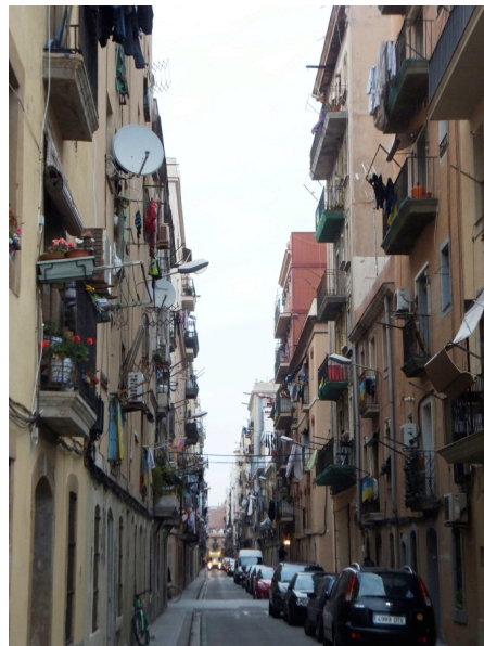
Figure 2: Narrow streets and balconies in la Barceloneta.

rather ironic that the official websites of Barcelona Tourism and the Catalan Tourist Board encourage visiting the suburb arguing that its balconies are icons which have appeared in many films (Agència Catalana de Turisme, n.d.; Turisme de Barcelona, n.d.b), when in reality the immense tourist and real estate pressure is forcing many neighbours and their ways of life out from the suburb. La Barceloneta is today the suburb of Barcelona with the most expensive average rent per square metre and there is a growing tendency to seasonal rentals instead of longer rentals (Benvenuty, 2016). Hence the expulsion of many long-term residents with low incomes.