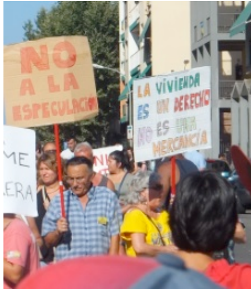
Figure 1: Residents protest against housing speculation.

La Barceloneta sits on a peninsula with a strategic location being Barcelona's gate to the sea. Mercè Tatjer (1973), in her exhaustive work about the origins and development of the suburb, explains that la Barceloneta was built outside the city's walls in the mid 18 th century to respond to the demographic and economic expansion of Barcelona, and it also served to accommodate those who lost their homes to the construction of the Citadel (pp. 37-9). The suburb was designed by military authorities as a uniform grid to be easily controlled, with narrow streets to squeeze as many buildings as possible, and only ground-floor houses to permit the vigilance from the city over the sea. Tatjer explains that before the suburb was built, there were huts and warehouses for fishers on its beach and the area already had strong links with port activities (p. 39). The first residents of la Barceloneta were fishers and workers in sea-related trades who extended their working practices to the streets due to the lack of indoor space. And as place is, in Jody Berland's (2005) words, "the outcome of social practice" (p. 258), the habits of dwellers and in particular their appropriation of public space deeply shaped the suburb. Residents filled the streets and contributed to build an identity tightened up to sea activities.