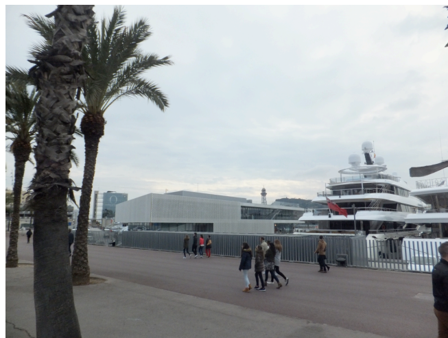
Figure 3: The result of the restructuring of Port Vell.

Such waterfront developments have contributed to the boom of tourist apartments, most of them without a licence, and to the rocketing of property price in la Barceloneta. Neighbourhood associations have been actively campaigning against this