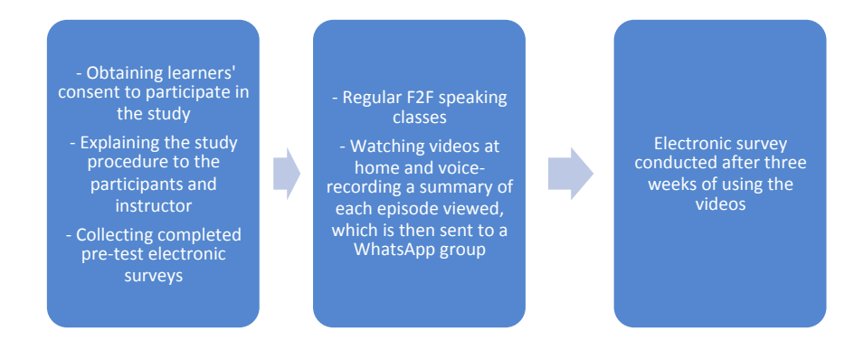
Figure 1: Teaching and Study Procedure

The students were undertaking an English Listening and Speaking course, as female Intermediate-level undergraduate EFL learners, having passed the standardized language ability test for acceptance by the English Department at the College of Languages and Translation. For the English Listening and Speaking course, they received two weekly sessions with their instructor.