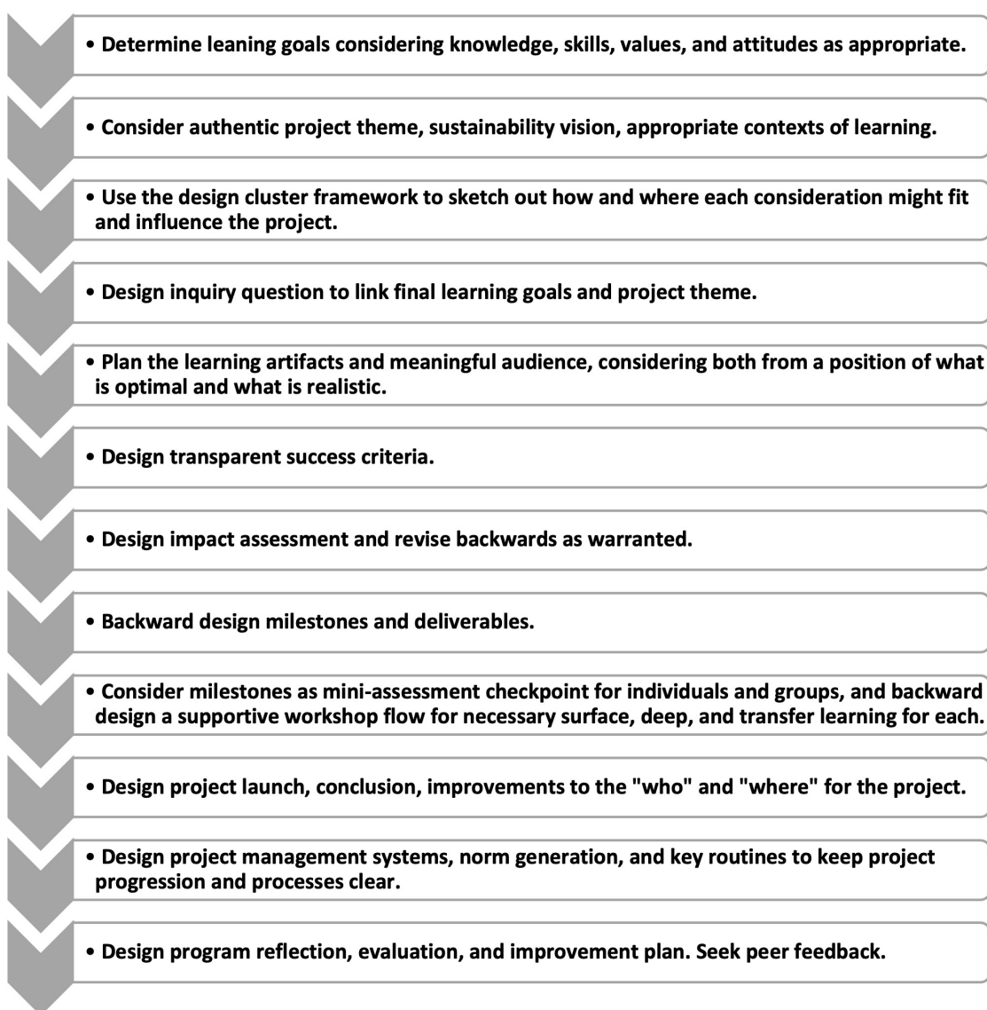
Figure 2 Sample Design Workflow

Given the need for contextualization in the design process, the following sample design workflow is intended to provide an example of design process using the Global PBL Design Framework. The process can be ordered in different ways and is often iterative in nature.