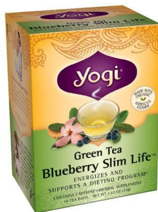
Fig. 3. American Yoga Tea Packaging

Various tea packaging designs in Europe and the United States have a strong visual impact, reflecting the concern for humanistic features of the "people-oriented" concept. Designers focus on people's emotional needs, through humanized design, packaging can communicate and exchange with people's hearts. Europe and the United States tea packaging design text clear, illustrated, at a glance, for different levels and needs of the buyer has brought great convenience.