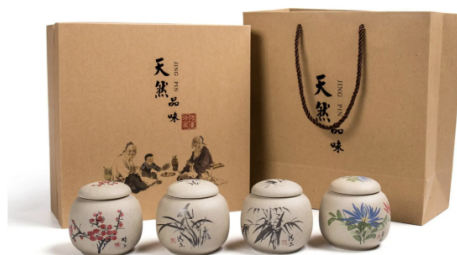
Fig. 2. Four Seasons Tea Packaging

Tea packaging design is an important part of tea culture, need to have a high level of artistic conceptualization, showing a certain charm, in order to present the beauty of art. For example, Pu'er tea ceramic packaging using traditional Chinese ink painting, sketching out the picturesque landscape scenery, giving people a simple and solemn artistic mood. In short, Chinese tea packaging design shows the charm of traditional Chinese tea culture through rich cultural connotation and unique artistic expression.