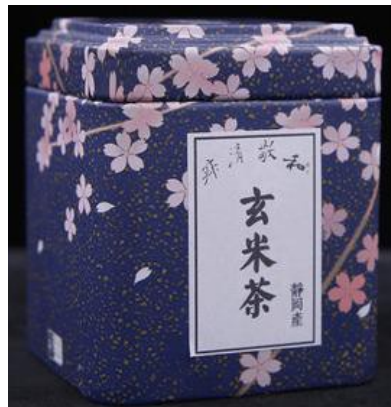
Fig. 4. Japanese Genmaicha Packaging

In Japanese tea packaging design, designers advocate the modern design movement of internationalism, incorporating a sense of the times and modernity on the basis of inheriting national traditions. They tend to use natural materials or environmentally friendly materials to make packaging, such as bamboo, wood, grass and rattan, as well as various kinds of recycled paper as shown in Figure 4. These materials are abundant and cheap, non-toxic, harmless and easy to degrade, which not only give the tea packaging works a unique natural vitality, but also meet people's aesthetic demand for environmental protection. Designers focus on the overall harmony of the packaging, the balance of colors, the precision of shapes, and the use of simple lines and rustic patterns to express the deep meaning. Tea packaging usually adopts fresh colors, such as light green, soft brown, and plain gray, to show the natural beauty of tea. Design elements often use traditional Japanese painting styles, such as ink paintings or washi paintings, to present the scenery of tea gardens, the rituals of the traditional tea ceremony, and the beauty of tea utensils, in order to evoke the user's empathy and respect for Japanese tea culture. Japanese traditional patterns, such as cherry blossoms, maple leaves, peacocks, etc., as well as motifs signifying good luck and happiness, often appear in the package design, adding a unique national mood to the package.