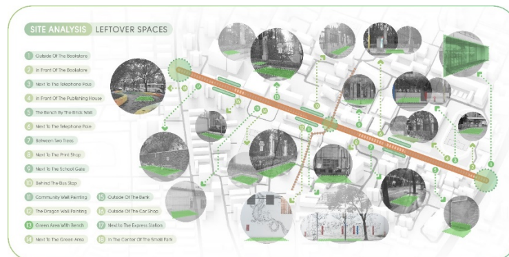
Figure 1. Leftover spaces exist on Chifeng Road.

As shown in Figure 1, there are a series of leftover spaces exist on Chifeng Road. The author extracts elements based on the characteristics of the leftover spaces and their surroundings in order to establish connections between the shapes, structures, interactions, materials, and colors of the new emotional healing installations and the original leftover spaces.