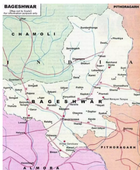
Figure (2) Location map of study area in India