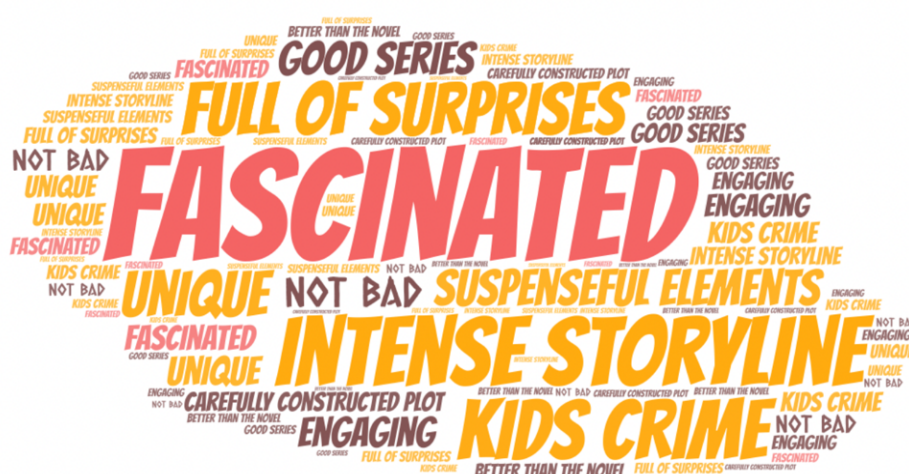
Figure 2: Word cloud chart

In this paper, the 2,000 Chinese comments of "The Bad Kids" were saved in text format, translated into English by the author, and the word cloud chart were generated using "WordCloud" application for analysis. The keywords in the word cloud chart can reflect the main focus of audience attention (Yang, 2019). As seen in Figure 2, the most dominant words in the comments about the perception of TV series are "Fascinated", "Intense storyline", "Full of surprises", and "Good series". These positive words indicate that "The Bad Kids" is a popular "transmedia adaptation" in terms of perception.