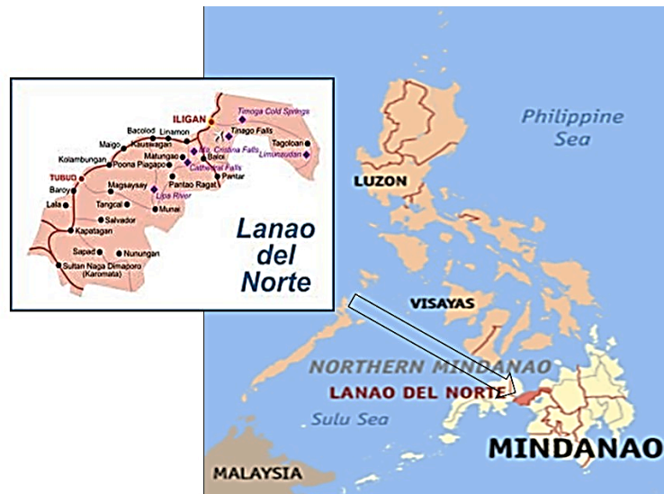
Figure 1. Location of Lanao del Norte.