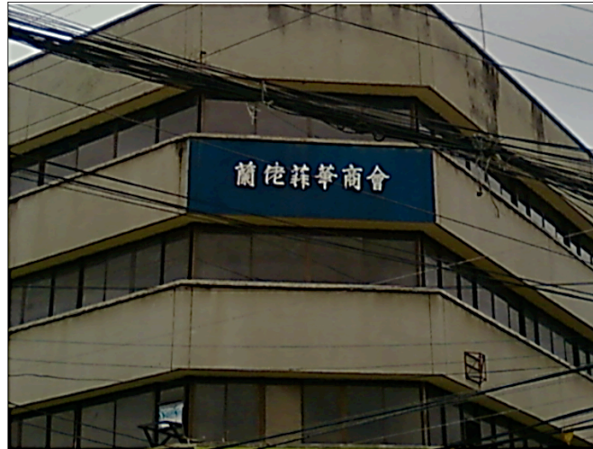
Figure 5. The Lanao Filipino – Chinese Chamber of Commerce, Inc Office in Iligan City. © Ngo, 2010