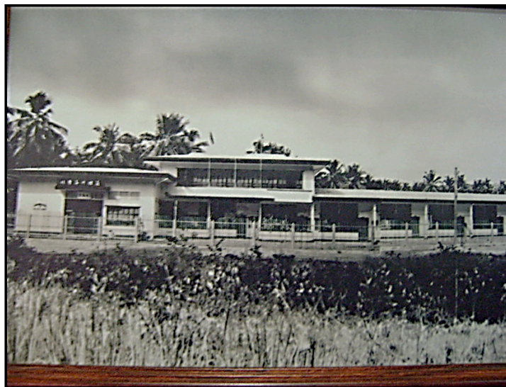
Figure 6. Lanao Community School in 1951.

In 1938, the Chinese in Lanao del Norte had concentrated their efforts for the establishment of a Chinese school. This move was then spearheaded by the association with the support of the Chinese community in the province. Since there were only a few Chinese at that time, the school started with only a little more than ten students and operates in the same building with the association. Before the outbreak of the war, the Chinese educational system was patterned with China’s educational system. However, in 1951, when the school was re-opened, it adopted Taiwan’s educational system.