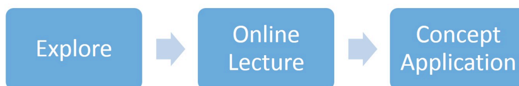
Figure 2: Students' learning cycle in Flipped Classroom Cycle 2

The flipped classrooms for the second cycle consisted of three stages, as outlined in Figure 2. The first stage involved in-class learning activities focusing on exploration of concepts where students would perform hands-on activities designed to investigate the concept, and included discussion on various probabilities with the intention to lead to an understanding of the concept. The second and third stages were similar to the students' learning cycle in the Flipped Classroom Cycle 1, which was to preview an online lecture, followed by concept application in class. In the case of students who did not watch the online lecture before class, they were asked to watch it at the beginning of the lesson and, after watching it, resume class to take part in the active learning phase of the course.