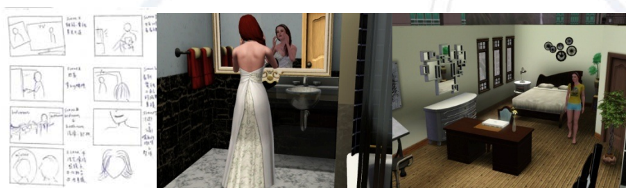
Fig. 3 The students' works form their storyboard, still plots, to animation

In this study, there were 18 animations scripts, 18 video game animation presentations, and 11 Machnima works in total. Three groups' final works were complete of their own styles. Thus, teachers encouraged them to participate in foreign Machnima contests and assisted them with the application procedures, hoping that they would be more confident about their own works. Moreover, the teacher encouraged them to engage in jobs related to digital games or animations in the future, helping them prepare for the future engagement in the cultural and creative industry.