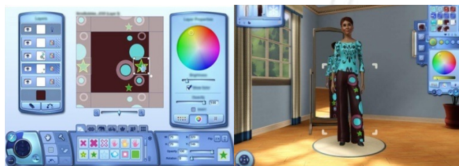
Fig 1. Create A Pattern.

Meanwhile, students could use "Create a Pattern" (Fig.1), a free official program by the game company, to practice coloring by drawing patterns to decorate the interior environment or change the Sims' clothes patterns. In class, students could even use pictures of the built-in "sticker bank" of this program or add their self-made patterns to create their own visual styles for further Machnima production.