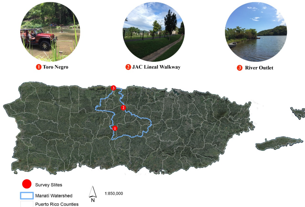
Figure 2: Survey Sites.

basin outlet, is the location where the river meets the Atlantic Ocean. Alluvial and marine deposits rest over the northern limestone region where people enjoy fishing and surfing, among other recreational activities.