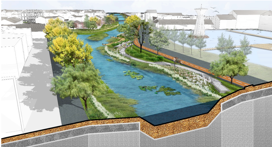
Figure 6: Rendering of rural river landscape renovation (drawn by the author)