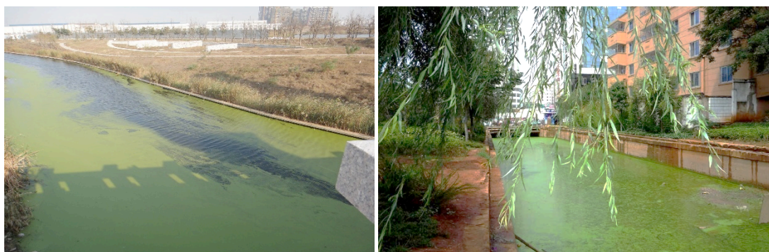
Figure 1: Increasing pollution of rural rivers (Internet image)

Situations: most rural rivers in China are now facing eutrophication of different degrees. Signs of life are becoming less and less, and the water environment of rural rivers is trapped in vicious circle (*1).