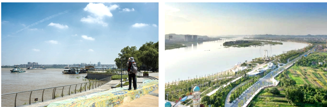
Figure 2: River landscape in different cities (Nanjing, Jiangsu VS Hanzhong, Shaanxi) are becoming alike (Internet image)

Situations: rivers in urban and rural areas of China nowadays tend to become identical. River landscape in the countryside lost their individual characteristics, becoming similar to the river landscape in cities.