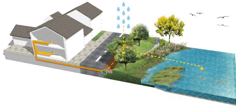
Figure 4: Rain water and sewage separation establishment in rural areas

Yaxi river faces the common problems of any other rural river in China nowadays, i.e. damage to natural ecology. The main pollutant of Yaxi river is discharged domestic sewage; so regulation is not difficult. Based on the current situations of the river and the requirement that design shall facilitate sustainable development, the regulation work will be divided into three stages, namely the near term, the middle term and long term. The former two will be the focus of our current work.