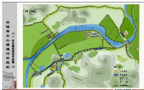
Fig.3 General planning of village construction

Yanhe Eco-village is located in mountainous area in Xiangyan city of Hubei province, China. It has 12 million m^2 land including 7.33 million m^2 forest, 0.64 million m^2 basic farmland, 0.66 million m^2 tea garden, 0.07 million m^2 construction land 0.01 million m^2 water area and other land. We could view the community clearly from Fig.3 to Fig.6.