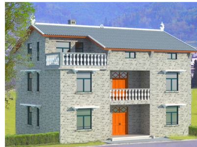
Fig.4 Architectural designing of green farmer house