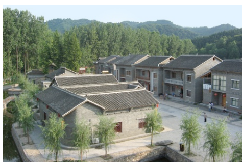
Fig.5 Eco-building in yanhe new village