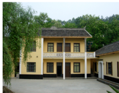
Fig.6 Old house renewal demonstration