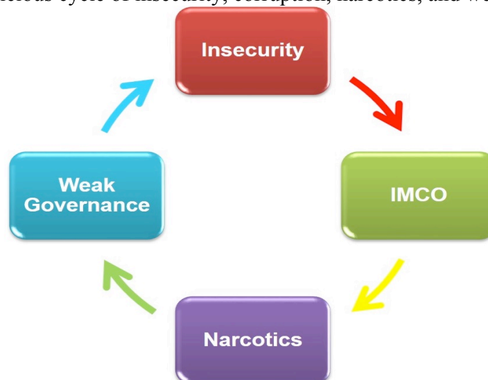
Figure 4: A vicious cycle of insecurity, corruption, narcotics, and weak governance.

Evidently, a vicious cycle by (The World Bank, 2004) presented below in the figure 4 illustrates that weak governance is unable to provide effective security, while poor security creates favorable environment for illicit opium cultivation and narco-trade. Consequently, illicit drug trade financially fuels insurgents, militia, and corrupts officials (IMCO) in Afghan government. As vice versa, IMCO undermines national security and destabilizes Afghan government institutions building.