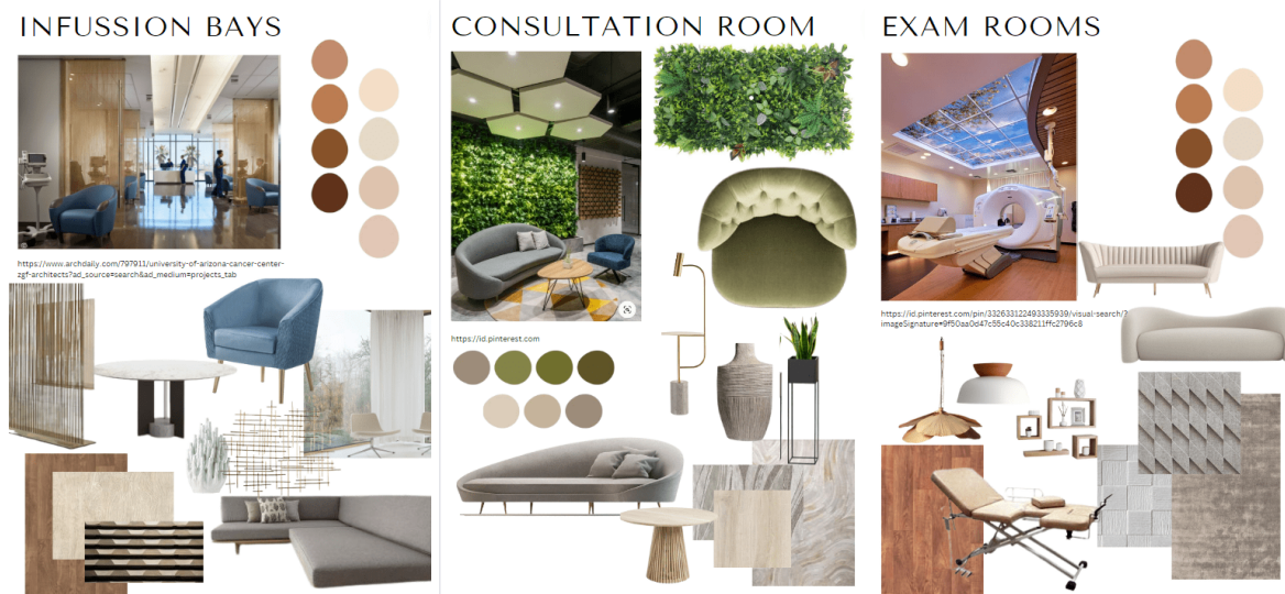
Figure 4. Mood Board: Infusion Bays, Consultation Room, Exam Room

In contrast to the previous mood boards, the design for the Infusion Bays, Consulting Room, and Exam Room (Figure 4) opts for softer colors with a greater emphasis on textiles. Textiles play a prominent role, appearing on the carpet, cushions, curtains, and sofa upholstery. These rooms, being more personal for patient care, require an interior design that is highly responsive to their somatosensory, visual, auditory, olfactory, and gustatory needs.