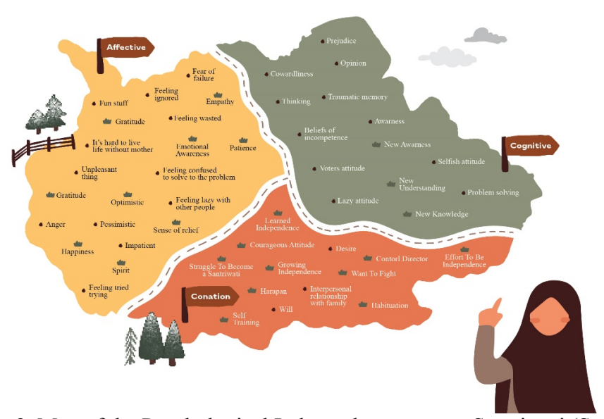
Figure 3. Map of the Psychological Independence among Santriwati (Santriwati)

The achievement of the quality of independence among santriwati was found, as it could be seen from the progress of psychological function in the dimensions of cognition, affection, and conation the santriwati had. The encounter of the three psychological functions had shaped the mental and spiritual patterns of santriwati through interactive reflection activities, such as transpersonal techniques in mentoring, which indicated an achievement in the experience of self-reliance that had been well actualized. The achievement of independence among santriwati was not at the peak because what had been achieved was always recognized, trained, and processed in order to sharpen the quality of their independence. The ability to capture the knowledge possessed by santriwati had encouraged the advancement of self-awareness, which was initially unable to become capable, from "not realize" to "realized." The development of the abilities and self-awareness among santriwati was obtained after the transpersonal creative writing assistance was performed. Therefore, the findings on the achievement of the quality of independence among santriwati who had participated in transpersonal assistance could be captured from the progress in psychological functions through the experience dimensions of their independence.