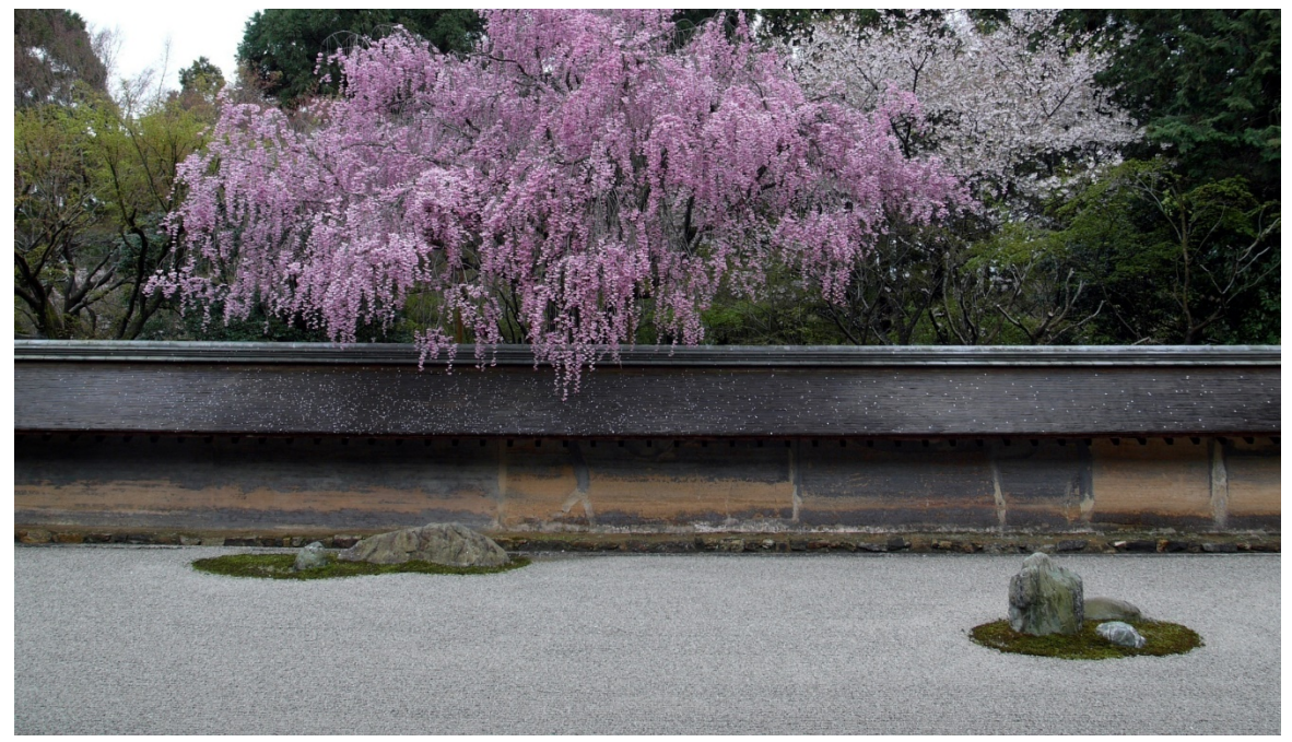
Figure 1: Ryoanji Temple, Kyoto

Queen Elizabeth of the United Kingdom visited a garden in her 1975 Japan tour. That was Ryoanji Temple (Figure 1) in Kyoto built in 1450. The garden is a rectangle of 248 square meters. Fifteen stones of different sizes were carefully composed in five groups: one group of dive stones, two groups of three and two groups of two stones. These are laid on a ground of white gravel, neatly ploughed by the monks each day. The only green plants in the garden is some moss around the stones. This is considered as one of the finest examples of Karesansui – dry landscape with its three basic elements of gravel, stones and moss.