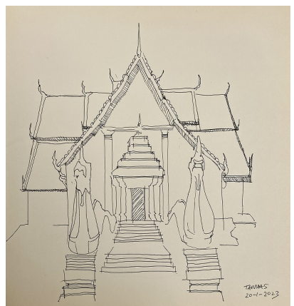
Figure 3: Urban Sketch of Wat Phumin No.2