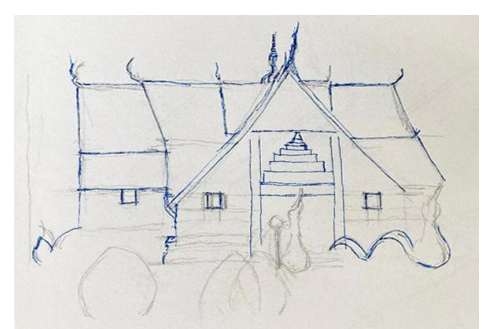
Figure 2: Urban Sketch of Wat Phumin No.1