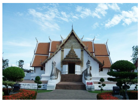
Figure 1: Wat Phumin

As part of the study, the researcher created urban sketch images to assist in presenting questions to participants about the research findings. These sketches were identified as figures 2 and 3. Within the collection of images representing the Phumin-Ta Li community in Nan province, Figure 1 featured a photograph taken by the researcher, highlighting Wat Phumin, Nan province.